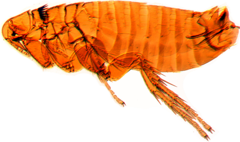
FIGURE 3. The flea species Ctenophthalmus nobilis (Rothschild, 1898) is now found on three Faroese islands, including Eysturoy, Streymoy and Vágar.