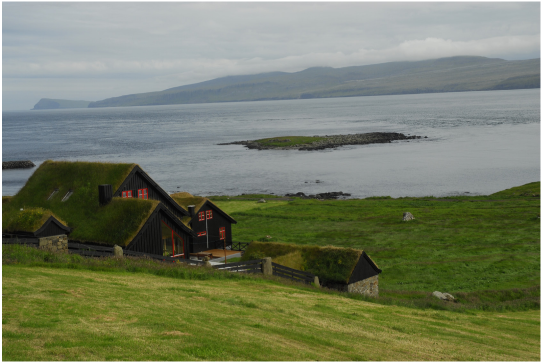
FIGURE 2. The flea species Ceratophyllus garei (Rothschild, 1902) was found for the first time in the Faroe Islands in an eiders nest on the islet ‘Kirkjubøholmur’, which is located about 250 m outside the village ‘Kirkjubøur’ on Streymoy. In 2011, 120 pairs of eider bred on this islet.

All the collected fleas were preserved in 70% alcohol. For our convenience, the fleas were separately slide-mounted, following the technique described by Palma (1978). The identification follows Brinck-Lindroth & Smit (2007) and Smit (1954, 1957). For the details, see Jensen & Olsen (2003). Voucher specimens of the flea species, found in the present investigation, are deposit in the collections of the Natural History Museum (Tórshavn, Faroe Islands). Specimens are also available from the first author of this paper, Jens-Kjeld Jensen, Nólsoy, Faroe Islands. Voucher specimens of all flea species, recorded in the Faroe Island during the last 20 years are also available at the same places.