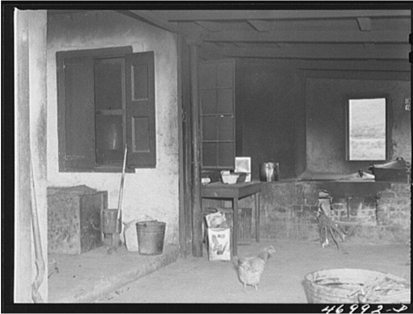
Kitchen in Leprosy Hospital, Christiansted, St. Croix, Virgin Islands, 1941.