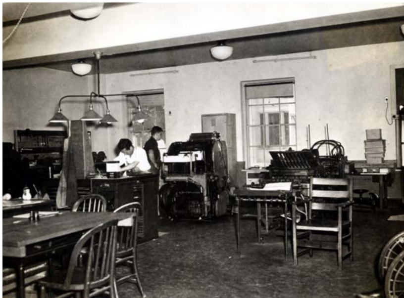
Pressroom, The STAR, Carville, 1950's.