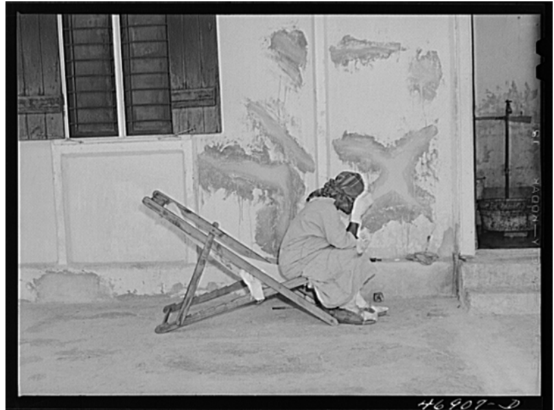
Unidentified woman from Leprosy Hospital, Christiansted, St. Croix, Virgin Islands, 1941.