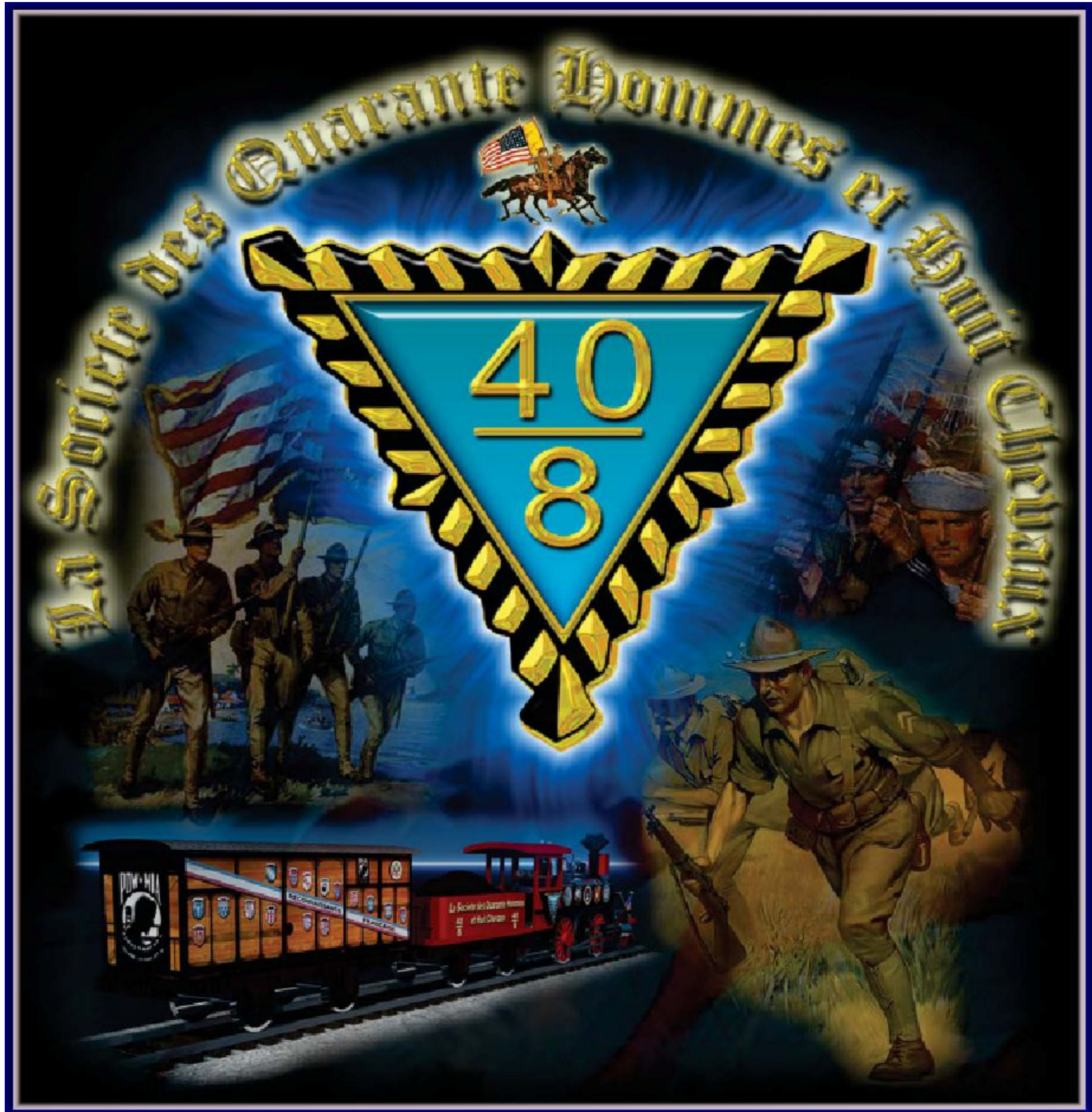
The Forty & Eight –a Long Time Supporter of The Star