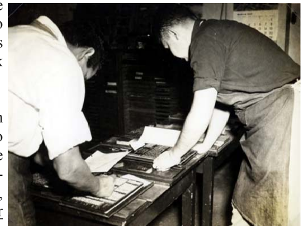
Setting linotype, The STAR, Carville 1950's.