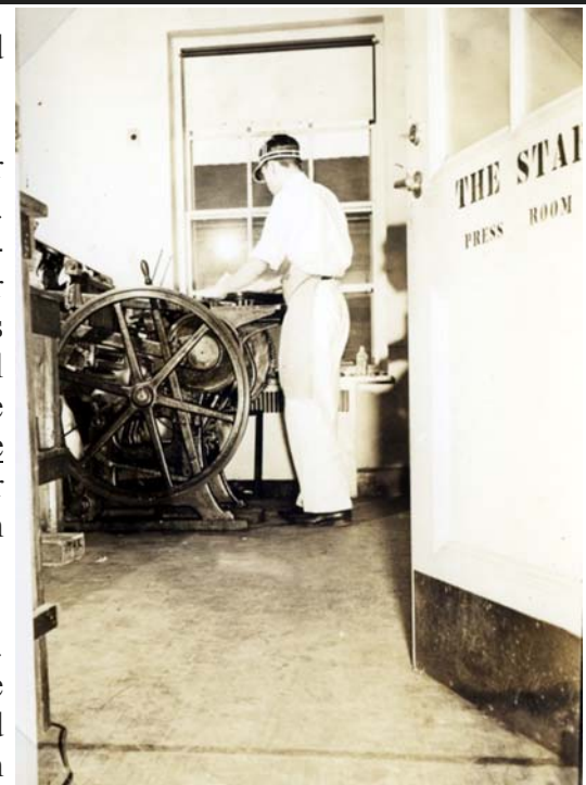
Pressroom, The STAR, 1940's.