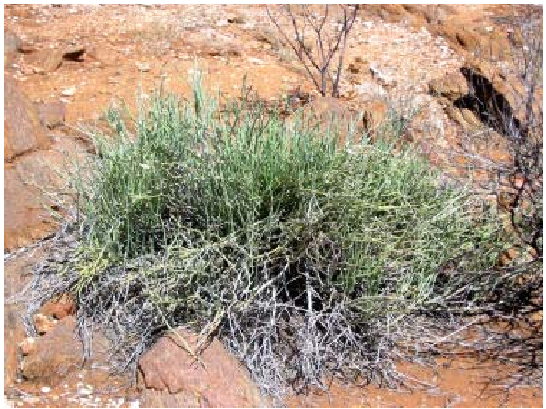
Image 3 - Milk-bush or caustic-vine. In Central Australia, settlers used this Aboriginal healing plant by applying the sap, or 'milk', to sores. Photo: P.A. Clarke, Macdonnell Ranges, Northern Territory, 2007.

oleracea) creeper as a cooling diuretic medicine to increase the volume of urine (Bindon 1996: 206; Hiddins 2000: 32; 2001: 17; Low 1988: 122). A Central Australian example of bushmen adopting an Aboriginal healing plant was the application of the sap, or 'milk', from the milk-bush (Sarcostemma australe) (Image 3) to heal sores (Koch 1898: 114).