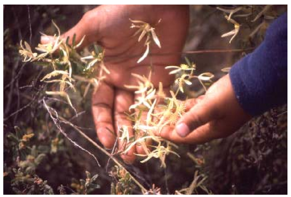
Image 2 - Old man's beard creeper, which was used by Aboriginal people and European settlers to relieve joint pain. Photo: P.A. Clarke, Narrung Peninsula, South Australia, 1989.

The influence of Indigenous plant use practices is apparent in the origin of a few colonial remedies. In the early nineteenth century, Aboriginal women living with European sealers in the southern region from Kangaroo Island to Bass Strait used their plant-based remedies and medical charms to treat their families (Clarke 1996: 62; Leigh 1839: 160-1). In these communities, 'teas' made from 'bush ti-tree' ( Leptospermum & Melaleuca species) were used to medicinally 'purify' the blood ( Adelaide Observer 28 Sept. 1844: 6). In south eastern Australia the settlers used the Aboriginal remedy of applying a poultice made from the old man's beard ( Clematis microphylla ) creeper (Image 2) onto aching joints of the legs and arms (Clarke 1987: 6; Lassak & McCarthy 1983: 56).