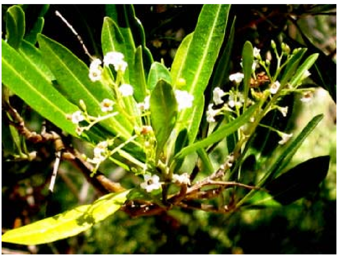
Image 4 - Poison corkwood, the leaves of which were an Aboriginal narcotic and game-poison. The species was intensively studied by pharmacologists from the late 19<sup>th</sup> century.

Since the late nineteenth century, chemists and pharmacologists have investigated the medical potential of Indigenous Australian plants. One of the plants that attracted the attention of researchers in the 1880s was the poison corkwood tree ( Duboisia myoporoides ) (Image 4), which inland Aboriginal groups used as a narcotic and a poison (Clarke 2007: 105, 124).