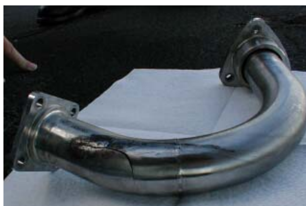
Figure 4 Fuel Pipe Crack & Scratches