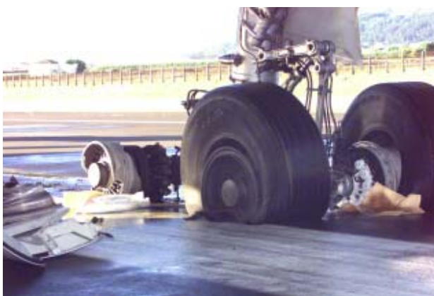
Figure 2 - Left-main Boogie

Due to the engines-out condition, the landing was conducted without the brake anti-skid and normal braking systems. Because the emergency brake accumulator only provides for a limited amount of brake applications, full braking was applied and retained at the second touch down, resulting in the main wheels locking up. The tires quickly abraded and deflated at a point between about 300 and 450 feet beyond the second and final touch down. The segments of the main wheels contacting the pavement were worn down to the bearing journals, the left, rear, inboard wheel detached from the axle. Both left and right brake anti-torque links attachment horns on the bottom segments of the main oleos also contacted the pavement; the horns were abraded to the point that some of the links separated from the oleo resulting in the rotation of at least one brake carrier.