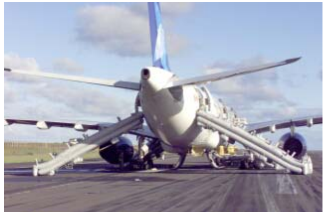
Figure 1 - Aircraft After Landing

At 06:45, the aircraft crossed the threshold of runway 33 at about 200 knots, touched down hard 1 030 feet down the runway, and bounced back into the air. The second touchdown was at 2 800 feet from the approach end of the runway, and maximum braking was applied. The aircraft came to a stop 7 600 feet from the approach end of the 10 000-foot runway. After the aircraft came to a stop, small fires started in the area of the left main-gear wheels, but these fires were immediately extinguished by the crash rescue response vehicles that were in position for the landing 6 . The Captain ordered an emergency evacuation. Fourteen passengers and two cabin-crew members received minor injuries, and two persons received serious injuries during the emergency evacuation. The aircraft suffered structural damage to the fuselage and to the main landing gear.