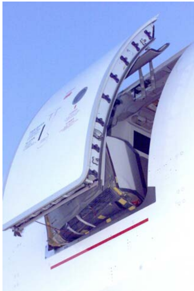
Figure 6 - Door L3 Jammed

Sometime after the landing, fire-rescue crews, in attempting to eliminate the hazard of the escape slide inflating within the cabin, used a pry-tool to release the slide and open the door. Reportedly, when the door was opened, the slide fell out the door and only inflated partially.