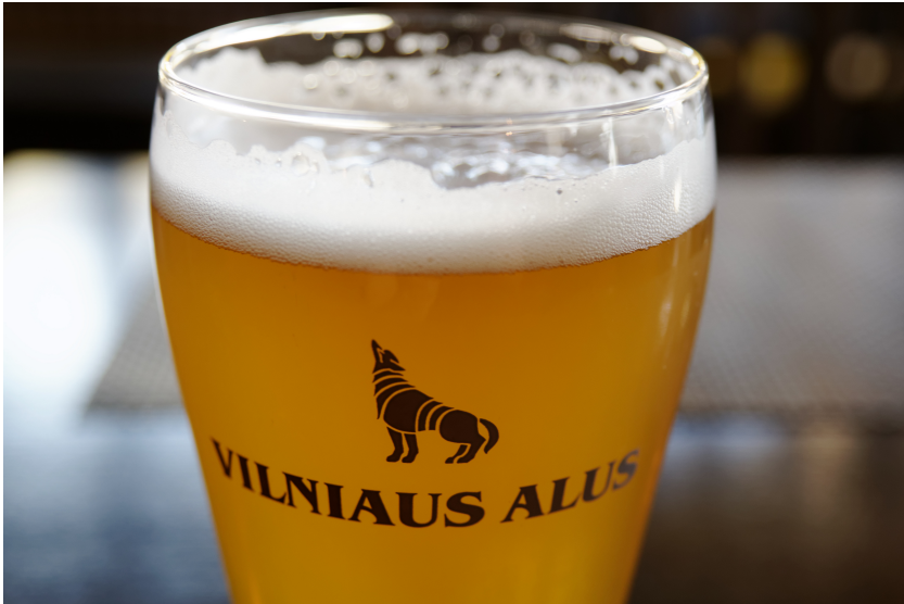
Figure 2.2: Vilniaus Kvietinis