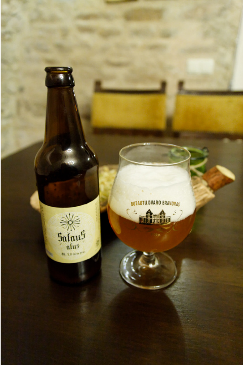
Figure 1.1: Kupiškio Salaus Alus