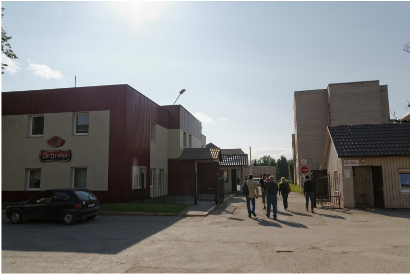
Figure 6.3: Entering Biržu Alus