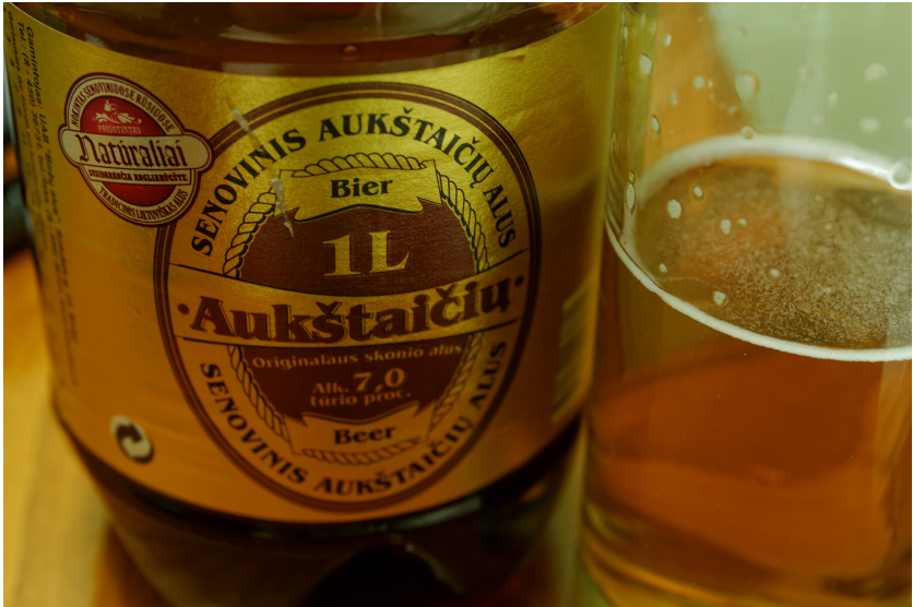
Figure 2.1: A šviesusis from Biržu Alus