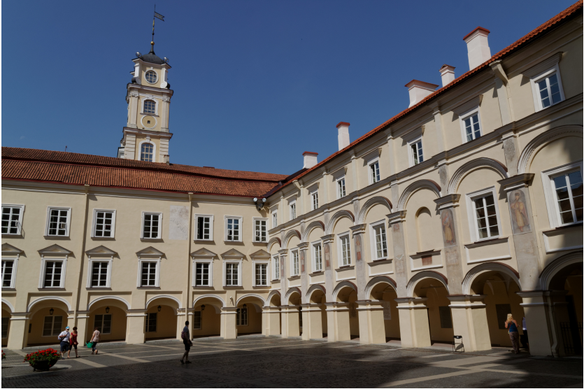
Figure 7.1: The Great Courtyard of Vilnius University

of these breweries have employees who speak English, which makes things difficult. If you know someone in Lithuania who can translate that will make things much easier.