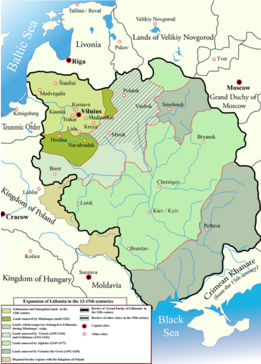
Figure 4.2: Grand Duchy of Lithuania, 1200-1430