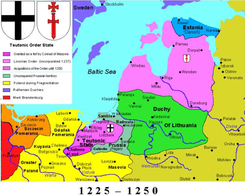
Figure 4.1: Baltic area, ca 1250, from Wikimedia Commons, user SpaceCadet