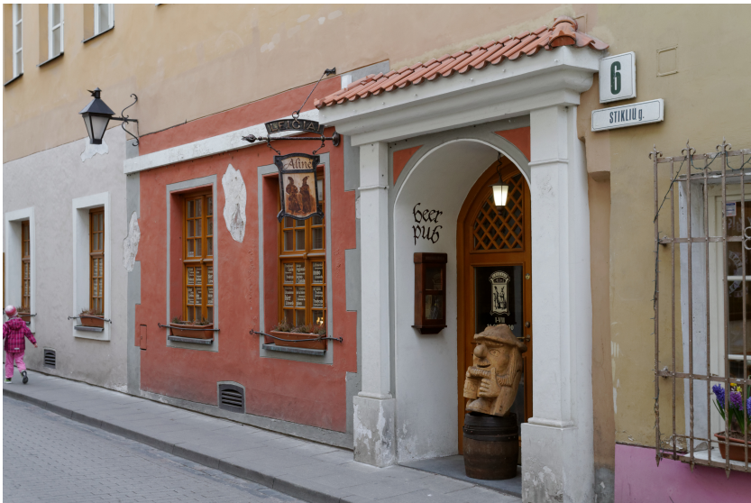
Figure 7.7: Alinė Leičiai