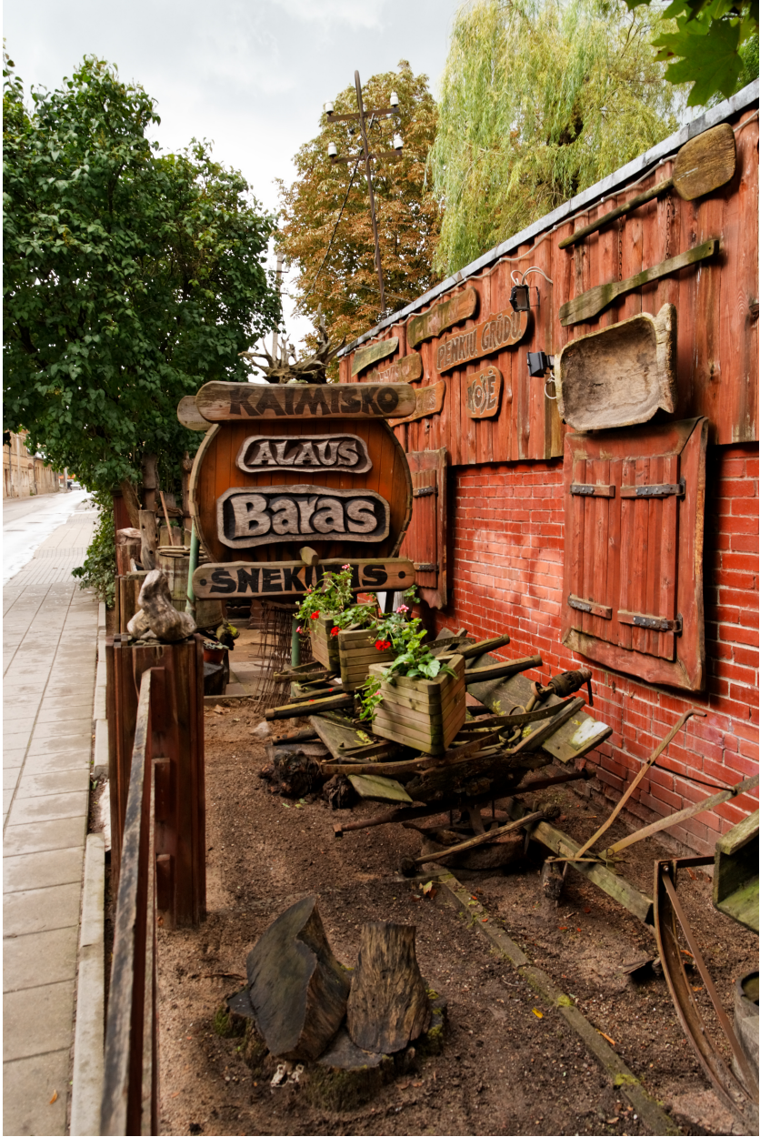
Figure 7.5: Šnekutis Užupio