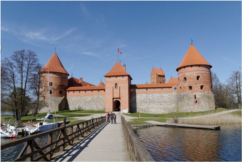
Figure 7.9: Trakai island castle