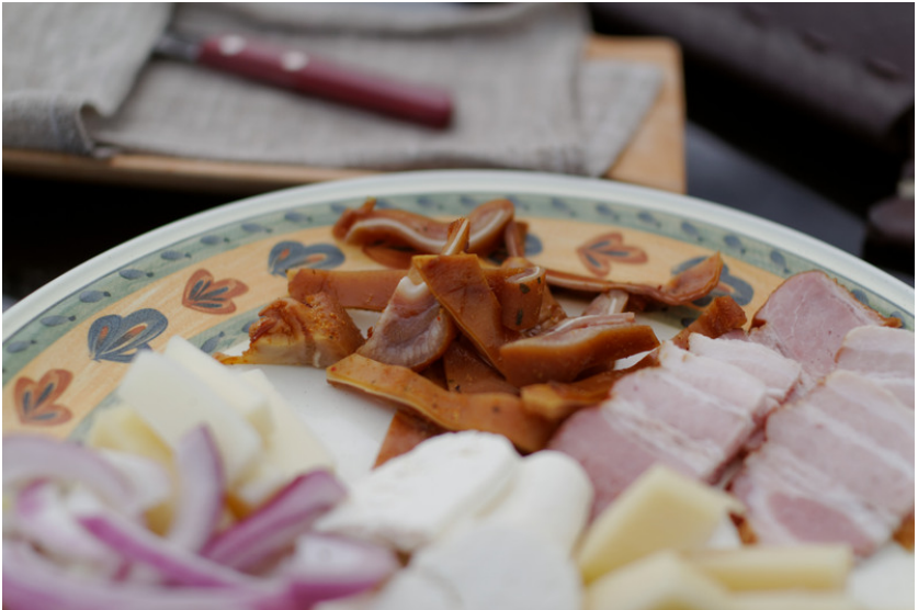
Figure 3.1: Smoked pig's ears