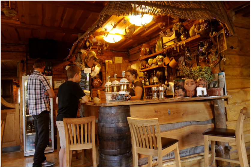
Figure 7.10: The bar at Prie Uosio