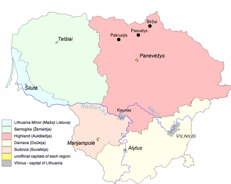
Figure 5.1: Lithuanian regions (from WikiMedia commons, modified by the author)