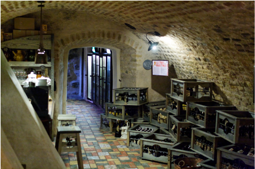
Figure 7.4: The shop part of Bambalyne