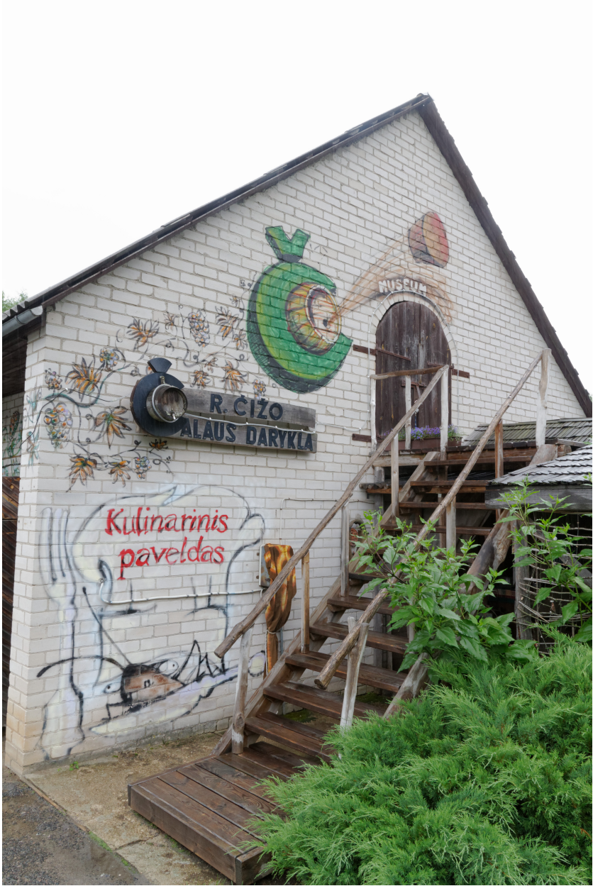
Figure 6.1: Ramūno Čižo Alaus Darykla, Dusetos