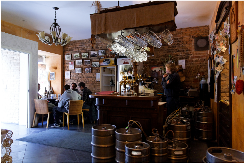
Figure 7.3: The bar at Šnektis Stepono