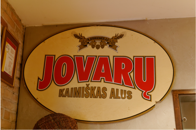
Figure 2.3: Jovaru Alus sign at Šnekutis