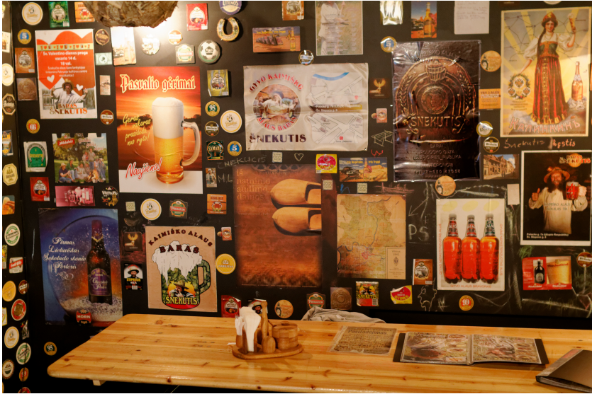
Figure 7.8: Decorations at Šnekutis Mikolajus

at the back is very nice (and always full in summer). The beer menu, unfortunately, is deeply confusing.