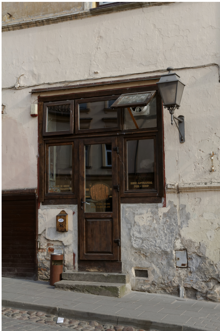
Figure 7.6: Špunka