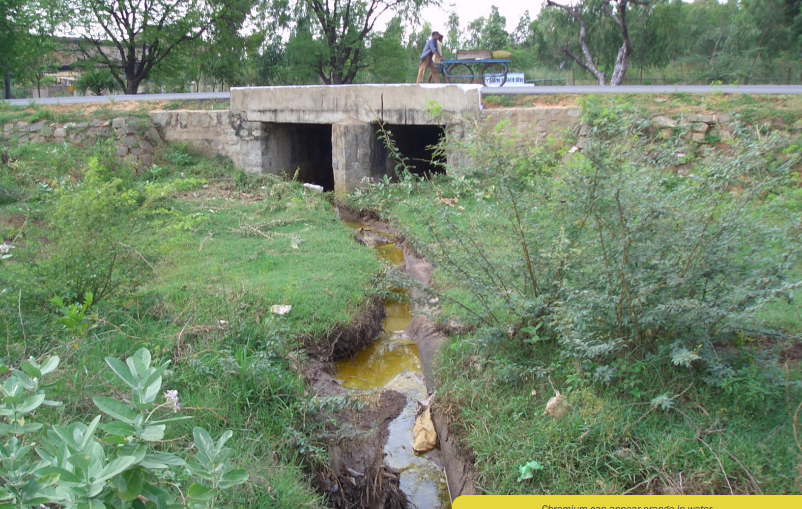
Chromium can appear orange in water