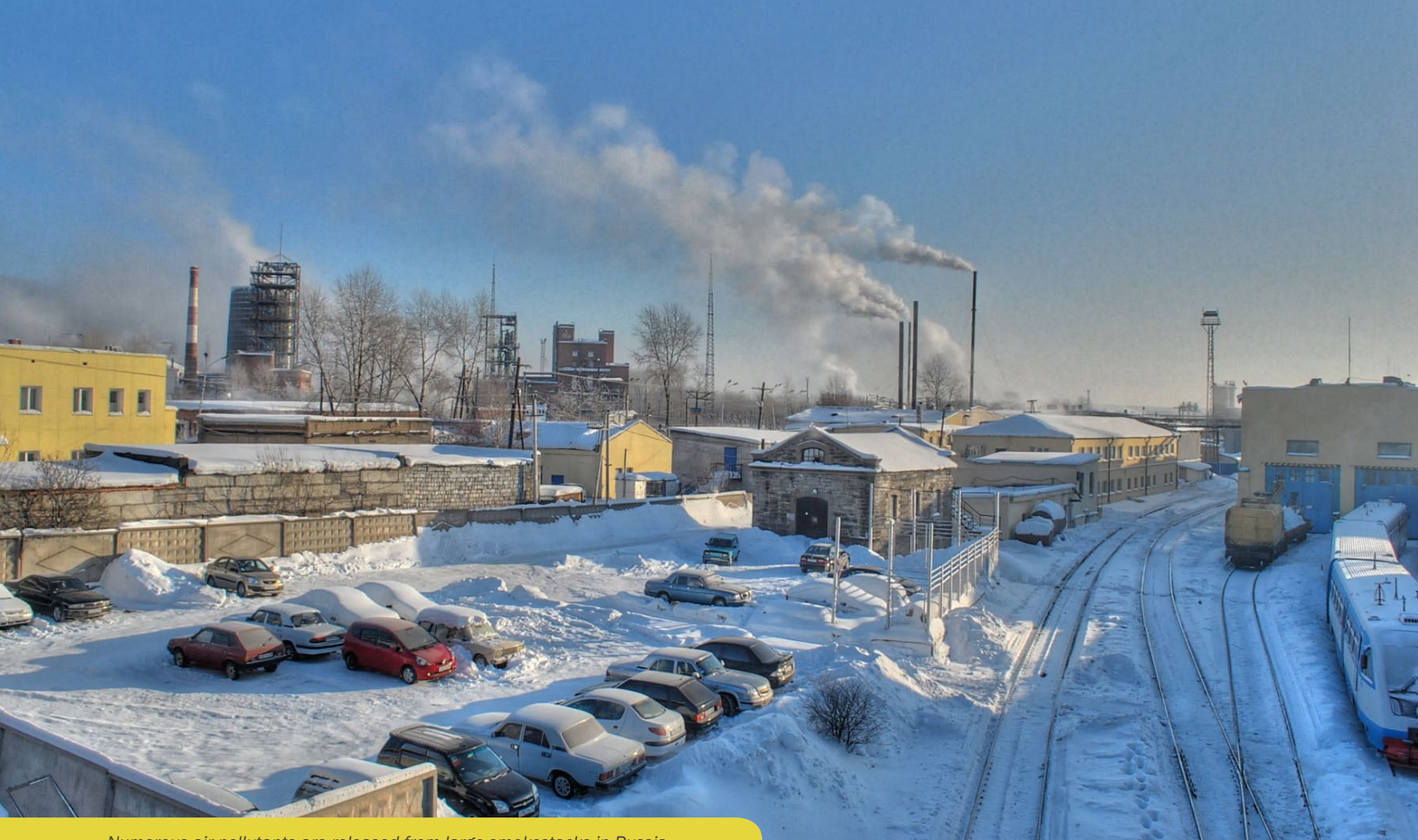
Numerous air pollutants are released from large smokestacks in Russia

Roughly a quarter of the city's 300,000 residents were still employed in factories that produce toxic chemicals at the time our 2007 report was published. In 2003, the death rate was reported to exceed the birth rate by 260%, and the city's annual death rate (17 per 1,000) is higher than Russia's national average (14 per 1,000). In a city of 300,000, that translates to about 900 extra deaths annually. The average life expectancy is reported to be 42 years for men and 47 for women. 77