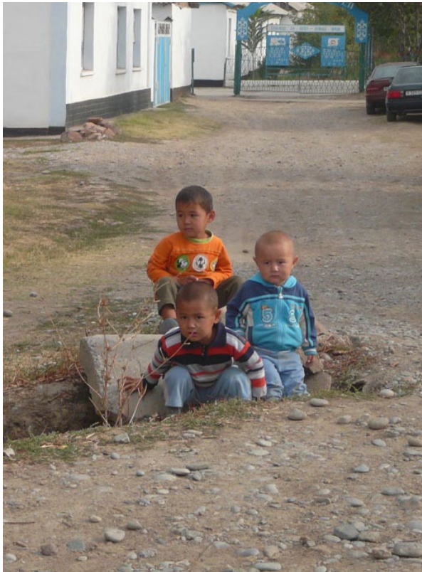
Children playing near in lead contaminated soil

Following the onsite activity, UASD, Blacksmith and TerraGraphics carried out a remedial program in the community with Inter-American Development Bank funding. The key components of this work were the construction of Gabian basket walls to limit soil erosion, removal of highly contaminated waste, and covering of contaminated soils with a concrete layer. This work was implemented in August 2010. Blood tests taken in September of the same year found an average BLL of 12.6 µg/dL (range 4-46 µg/dL), or