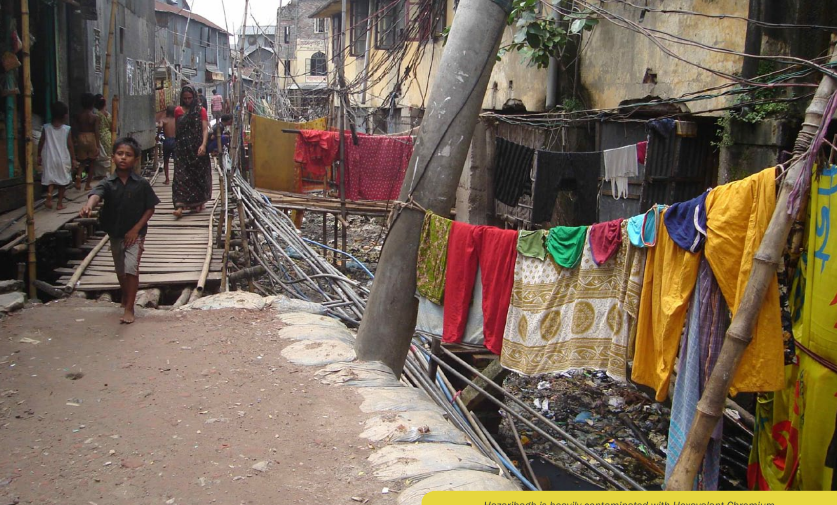
Hazaribagh is heavily contaminated with Hexavalent Chromium

A conservative estimate of the population at risk might fall in the area of 40,000 people. 5 However, a more in-depth assessment would be required to better capture the risk, which might affect as many as 250,000 people. Since 2008, Blacksmith Institute and its partner, Green Advocacy Ghana (GreenAd), have been piloting technologies to aid recyclers in replacing the burning process. Hand wire-stripping tools introduced in 2010 were met with a small-degree of success but burning remained the preferred method. Currently, project partners are working to mechanize the wire-stripping process through the creation of work stations outfitted with a variety of wire-stripping machines. These machines eliminate air pollution and centralize recycling to reduce wide-spread communal exposures. Comprehensive health and occupational safety trainings, implemented since 2008, have built the