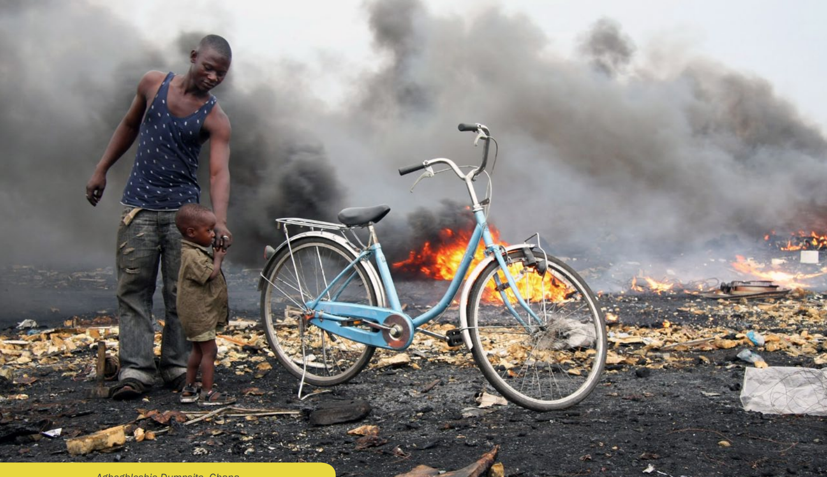
Agbogbloshie Dumpsite, Ghana

2020. Approximately half of these imports can be immediately utilized, or reconditioned and sold. 2 The remainder of the material is recycled, and valuable parts are salvaged.