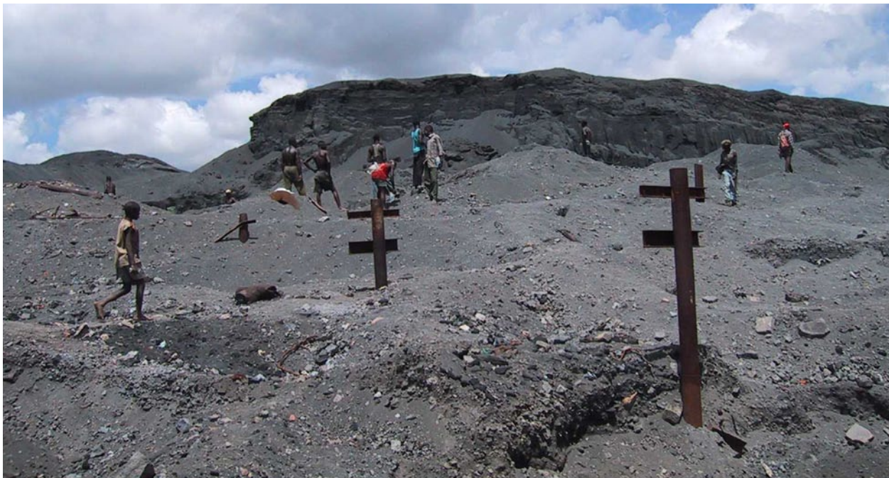
Tailings in Kabwe continue to mined artisanally