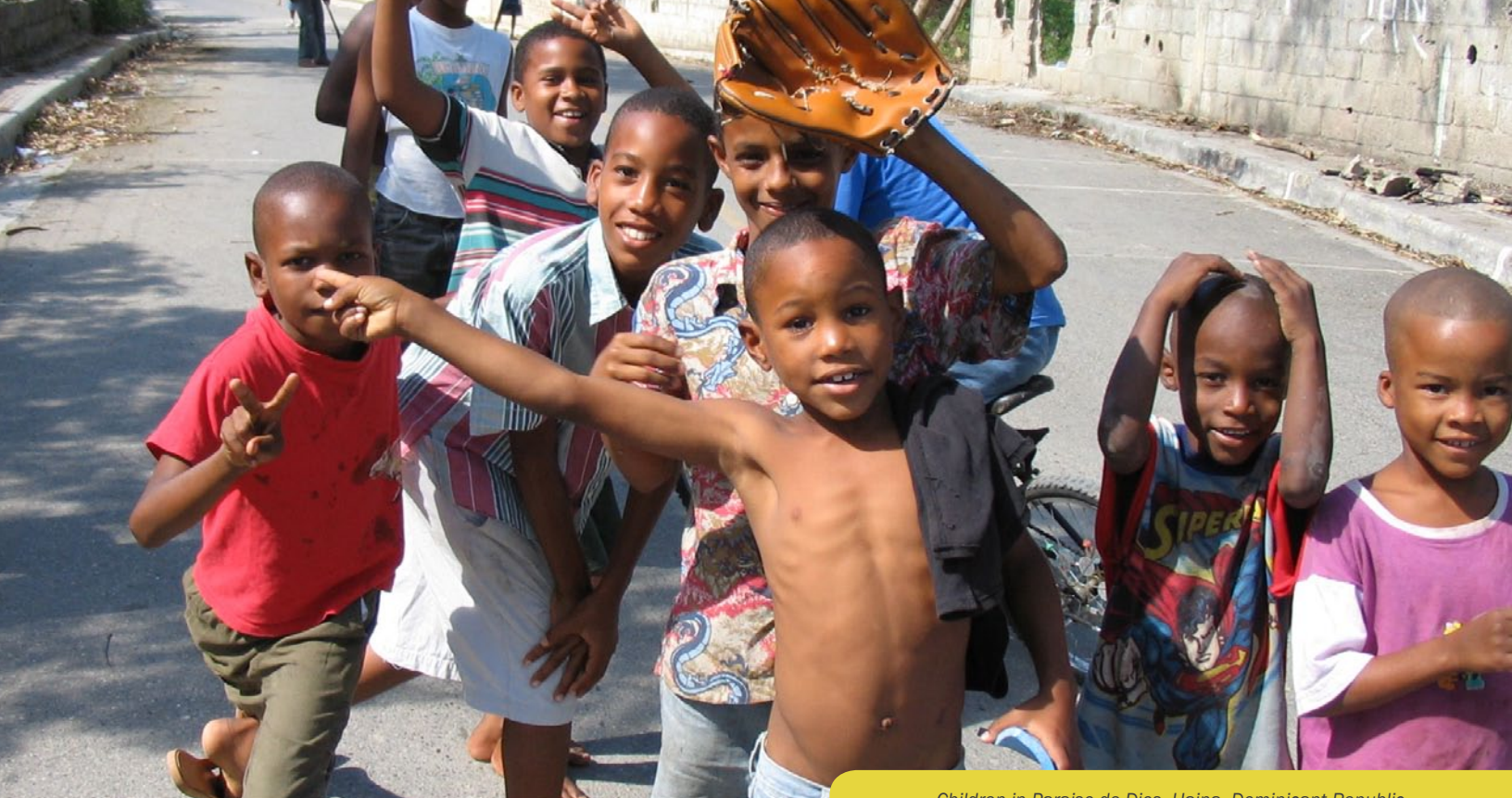
Children in Paraiso de Dios, Haina, Dominican Republic

million USD) were spent on site cleanup work, with funding mainly coming from the municipal government.