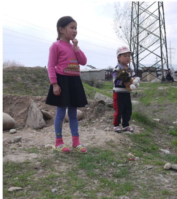
Mailuu-Suu is heavily at risk from radionuclides