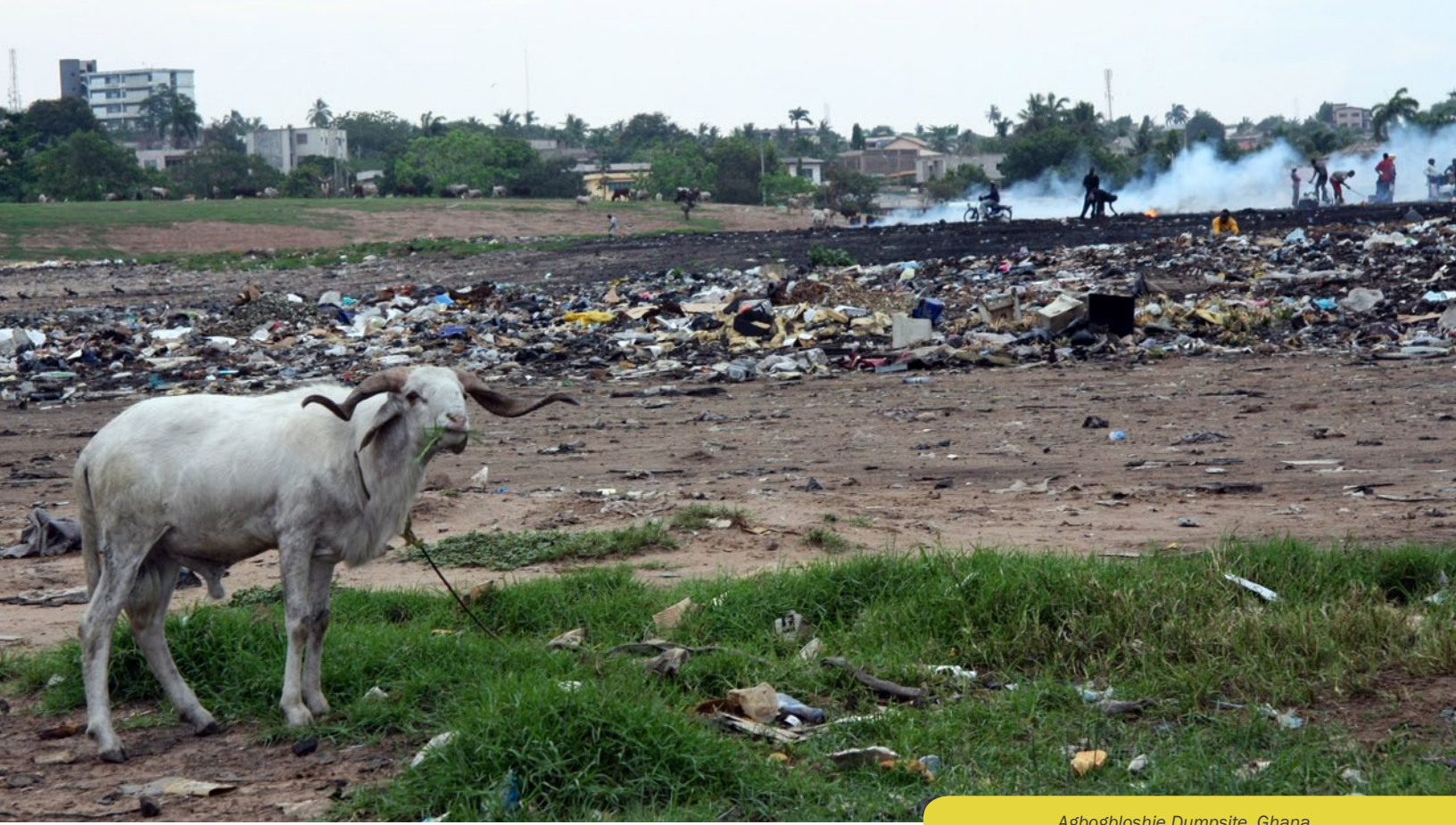
Agbogbloshie Dumpsite, Ghana

then examined the burden that toxic pollutants can put on population health in the context of the contaminated sites that are the focus of Green Cross Switzerland and Blacksmith's work. The identification and investigation of polluted sites is an ongoing task, increasingly being picked up and shared by local agencies in the countries involved. Therefore discussion of geographic regions in this report is by no means complete since it only represents sites that have been identified and are under investigation to date.