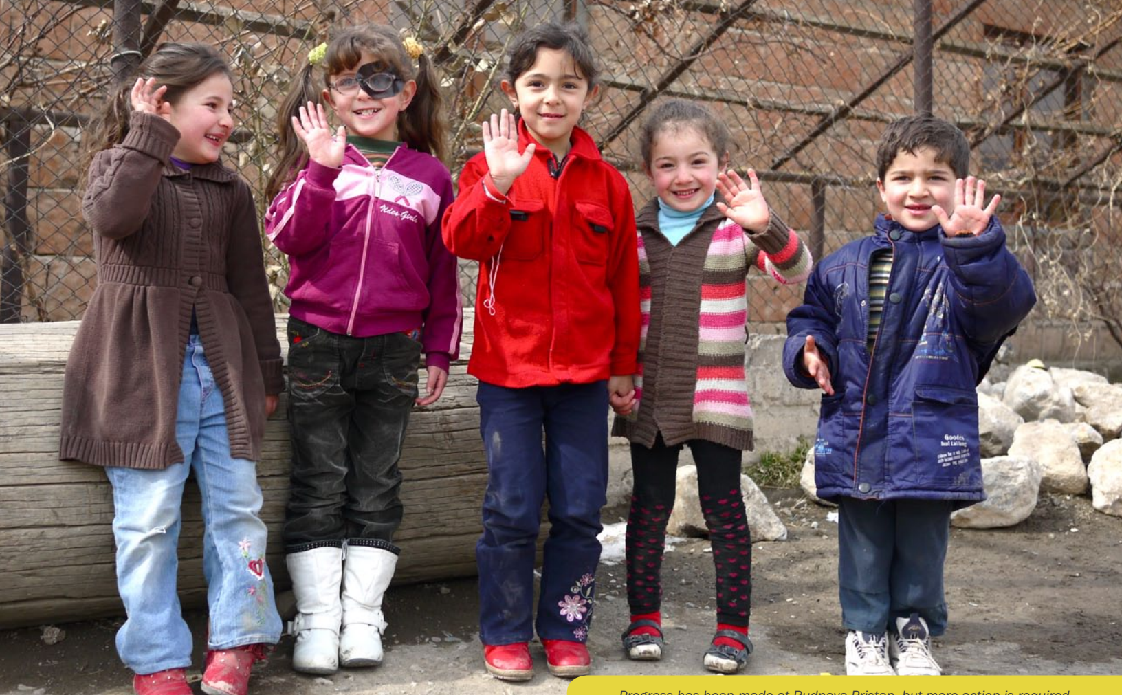
Progress has been made at Rudnaya Pristan, but more action is required

progress in dealing with pollution issues on a national level (see A Special Note on India below). The authors are hopeful that Sukinda will be addressed as part of these new programs.