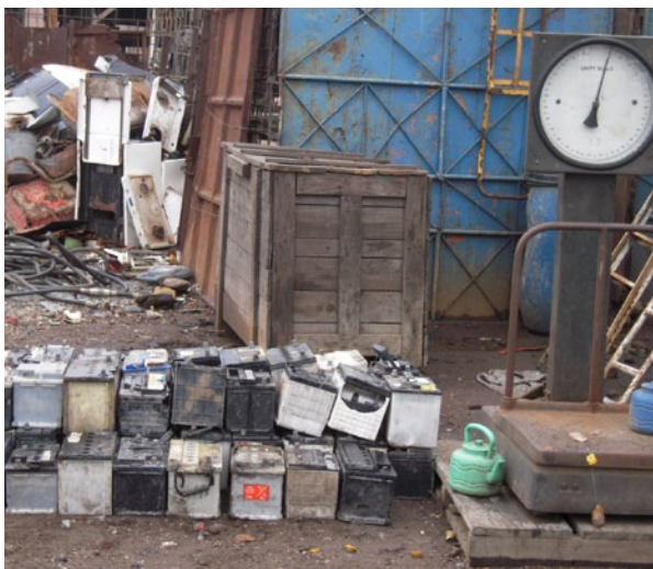
Informal used lead acid battery processing is one of the world's worst pollution problems

Current efforts include specific projects and related activities to deal with priority issues and sites, as well as technical and financial support to build the capacity of communities, governments, and industry groups to