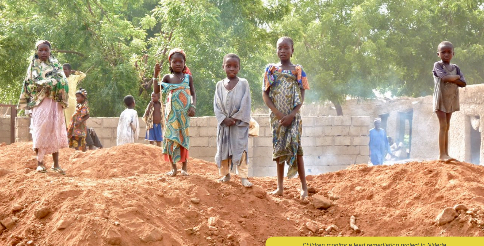
Children monitor a lead remediation project in Nigeria