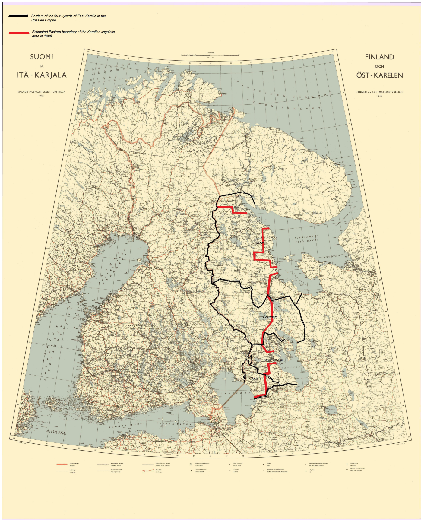
Map 1. The four uyezds and the linguistic boundary in the early 20 th century (Source of data shown: Homén, 1921)