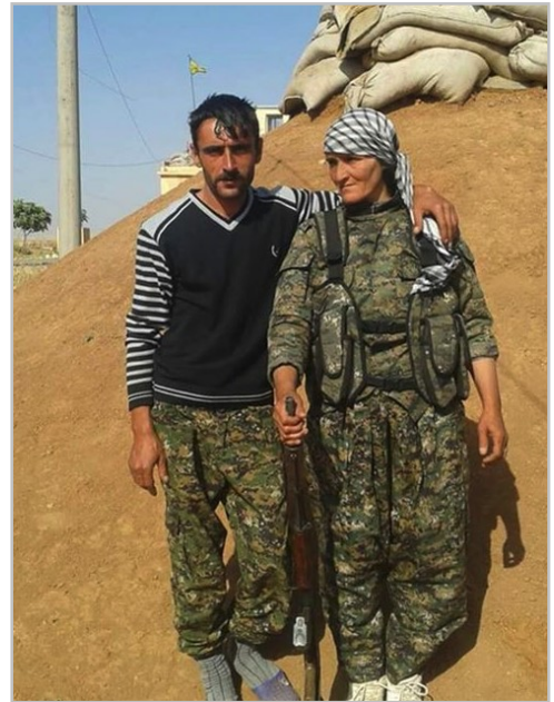
Syrian Kurdish son and mother.

It the same Asia Minor region to which Penthesileia belonged, one of the early queens named by some as Iran-dokht is Artemisia I. She was queen or satrap (governor general) of