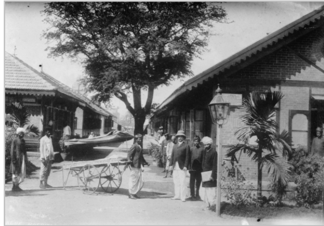
Caring for victims of the plague in Bombay/Mumbai.

Unfortunately, she contracted the plague herself and survived only to be so weakened that in 1902, she had to move to London for medical care.