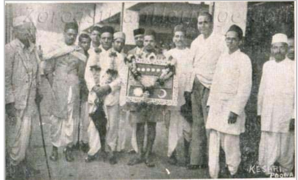
Bhikhaiji Cama’s flag being feted at the Kesari-Maratha Library in Pune, India.

In Stuttgart, Bhikhaiji did state, “This flag is of Indian Independence! Behold, it is born!” She would hardly have made such a categorical and dramatic statement about its birth if the flag had been ‘born’ elsewhere at an earlier date.