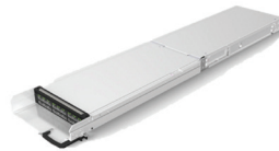
HP InfiniBand Switch for Apollo 8000