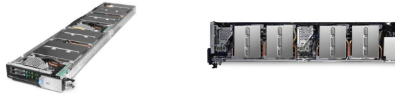
HP ProLiant XL730f Server