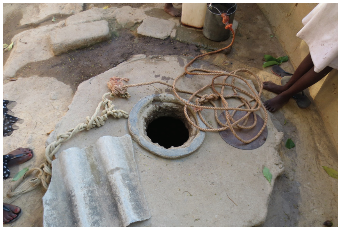
Unprotected well in Harare.

Shallow wells are extremely prevalent in Harare, and we saw them in every area we visited. Often while speaking with residents, they would show us the well they used for water. In many cases the wells were covered by rusty metal pieces that did not lie flat over the well. In some cases the cover lay next to the well, leaving the opening completely uncovered. People used dirty buckets attached to ropes to retrieve water from the well. Generally the rope and bucket were placed on the ground next to the well when they were not being used.