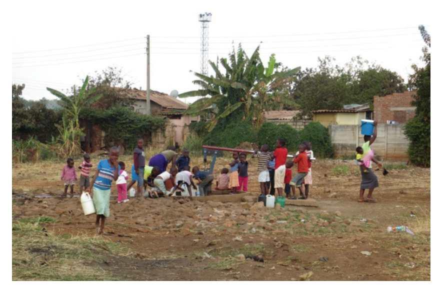
Women and children collect water at a borehole in Harare.

Access to water and sanitation can be particularly challenging for people who are already vulnerable or marginalized, including children, people with disabilities, and people with HIV. Often people in these groups must rely on others for help with basic needs, such as collecting water, going to the toilet, and bathing, because accessible services are not available. Since it has been well documented that vulnerable groups disproportionately shoulder the burden of inadequate water and sanitation, international law seeks to protect these groups by putting special obligations on states to ensure that these basic services are offered without discrimination, and can be accessed by all people.<sup>44</sup>