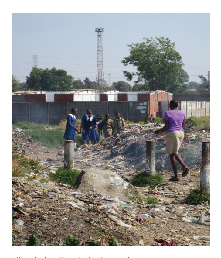
Piles of refuse litter the landscape of a passageway in Harare. Children use this path to reach their school.

In almost every area Human Rights Watch visited there were huge piles of burning refuse. Some of these refuse heaps were in public spaces, like shopping areas. Others were in fields or in the middle of residential areas. In one area, people were very upset because the refuse heap in the middle of their community was gigantic, spanning a large portion of their community space. On this refuse heap, in addition to household refuse, including diapers and toilet paper, there was a dead dog. Residents expressed concern that the combination of dead animals and human feces would only enhance the risk of disease.