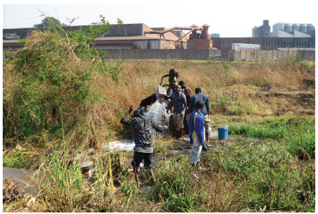
Desperate for water, residents flock to a burst public pipe.

According to WHO, every person should have access to between 50 and 100 liters of water per day to ensure sufficient quantity to meet basic needs. At a minimum each person should have access to between 20-25 liters per day, but this amount is not enough for basic hygiene and sanitation, and therefore raises serious health concerns.<sup>10</sup>