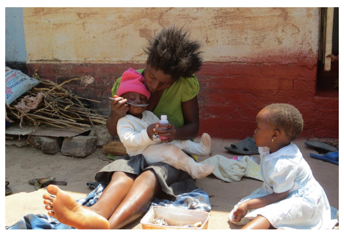
A mother gives medicine to her child with chronic diarrhea.

The public health necessity of improved sanitation has been well documented. Diarrhea, as a result of poor access to water and sanitation, is the biggest cause of death for children under 5 in Africa. Globally, diarrheal diseases kill 1.4 million children every year. Poor sanitation and hygiene also has a negative impact on maternal and newborn health. Unsanitary toilets and open defecation have negative impacts on both health and cognitive development. Due to lack of sanitation, more than half of school-age children in Africa suffer from worm infections.