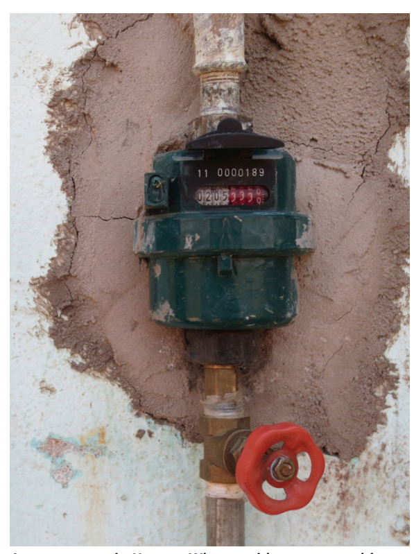
A water meter in Harare. When residents are unable to pay the fee and debts accrue, their tap is often disconnected.

My water bill is between $30 to $50 a month, but now I somehow have a