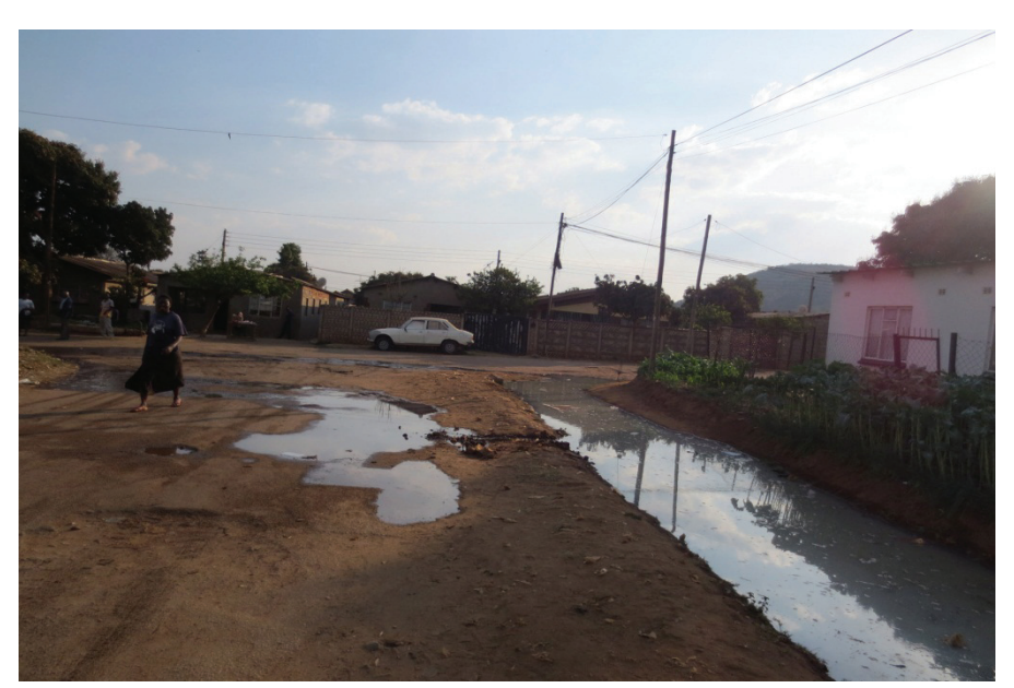
Standing sewage in a Harare neighborhood.

In Mabvuku/Tafara, a father showed us where there had recently been a burst sewer pipe, and pointed to where the sewage had been flowing in the street. A large mulberry tree hovered over the spot, and his son was playing in the area, and eating the mulberries off the ground. On the other side of the street, in a small field where the man said his family often defecates, he showed us the shallow well he uses for water.