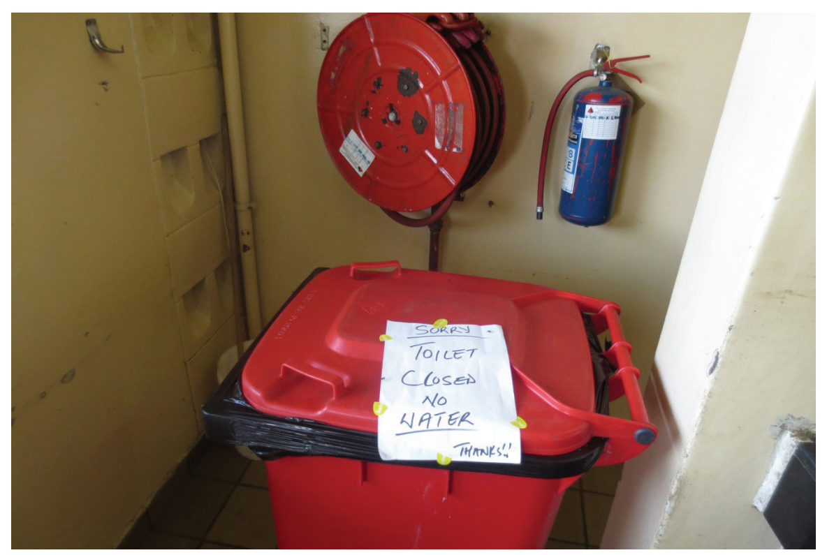
A sign indicates that a public toilet is closed.

Despite government statistics pointing to a low rate of open defecation in urban areas, people we interviewed said they often resorted to open defecation because they were unable to flush their toilets as a result of lack of water, or their toilets were clogged and overflowing, rending the toilets unusable.