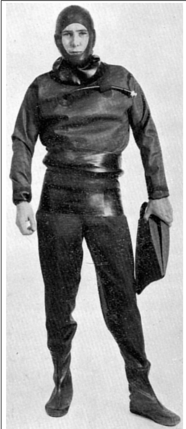
“Frogman” suit with braces, hood and neck seal

Siebe-Gorman moved in 1975 from Chessington in Surrey to Cwmbran in Gwent, later specialising in breathing equipment for firefighters. Siebe-Gorman and Heinke manufactured standard diving dress until the mid-1950s, when they diversified into stockinet-lined rubber suits for commercial and recreational underwater swimmers.