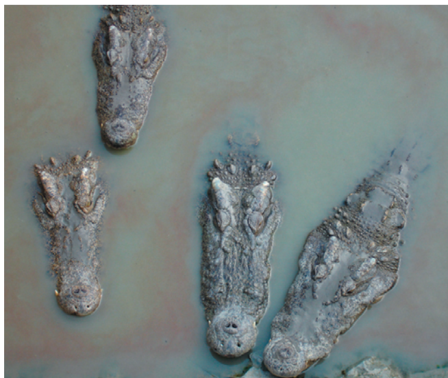
Figure 5 Captive adult C. siamensis .

constructed Ba River hydroelectric dam. A re-introduction of 60 adults/sub-adults to Bau Sau Lake in Cat Tien National Park was carried out in 2001-2004 (Polet 2002; Murphy et al. 2004), with at least one nest being produced in 2005. Regular monitoring indicates that few adults remain (at least 25% were killed in 2004 by local residents). A visit to the park in July/August 2009 detected hatchlings and juveniles, confirming that successful breeding continues (J. Thorbjarnarson, pers. comm.). Over 1000 crocodile farms and raising facilities, based almost exclusively on C. siamensis , are located in southern Vietnam (Jelden et al. 2008). Hybridization between C. siamensis and C. rhombifer has been noted as a concern (Jelden et al. 2008).