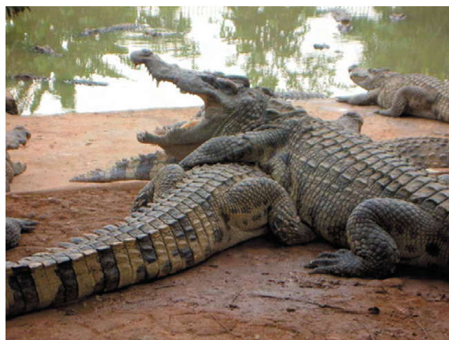
Figure 4. Captive adult C. siamensis .

Thailand : Historically, C. siamensis was widely distributed in some parts of Thailand (Platt et al. 2002), but most populations have been extirpated. The extremely threatened national status of the species appears unchanged since the 1992 CSG review. Surveys since the early 1990s have confirmed a highly fragmented and scattered population persisting in marginal habitats (Kreetiyutanont 1993; Ratanakorn and Leelapatra 1994; Ratanakorn et al. 1994; Platt et al. 2002; Temsiripong 2003). One hatchling was discovered at Pang Sida National Park in 2002 (Temsiripong 2003). A re-introduction project has been initiated by the Royal Thai Forest Service and the Crocodile Management Association of Thailand with 20 crocodiles being released in a pilot project in Pang Sida National Park in 2005 and 2006 (Temsiripong 2001, 2006). Monitoring by ranger patrols and camera trapping has detected few of the released animals (Temsiripong 2006). Further releases and sites are being considered. Many thousands of Siamese crocodiles are held on crocodile farms. Hybridization between C. siamensis and C. porosus has been noted as a concern .