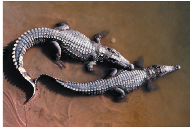
Figure 2. Adult C. siamensis .

Principal threats: Habitat loss, illegal hunting/trade, incidental capture/drowning in fish traps, extremely low and fragmented remaining populations.