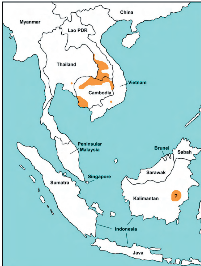
Figure 1. Current distribution of Crocodylus siamensis . Populations in Thailand and Vietnam were reintroduced (Pang Sida National Park and Cat Tien National Park respectively).

Range: Cambodia, Indonesia (Kalimantan), Laos, Thailand, Vietnam, (possibly Malaysia, Myanmar)