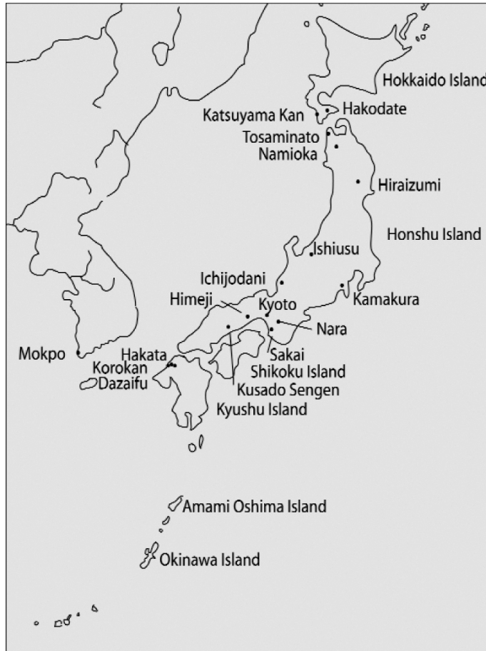
Figure 1. Map of Japan showing major sites mentioned in the text

of the 7 th to 9 th centuries and the 17 th century to the present. During this time there was a decline in the central authority of the Japanese (Yamato) state and the rise of local powers. The period is also marked by the development of separate realms of military and sacral power and the rise of warrior and merchant classes. From 1470 to 1570 Japan was wracked by internal strife and shifting power among local rulers loyal to the central power and those seeking local autonomy. This is the time period of the building of fortified castles in Japan, termed the Warring States period ( sengoku jidai ). The medieval period came to an end with unification under military rulers, whose power was consolidated in the Tokugawa period (1600–1867). Despite the political upheavals which occurred throughout the medieval period, there were three centuries of economic growth between 1250 and 1550 (Totman 2000, pp. 160–175). State control was very loose in