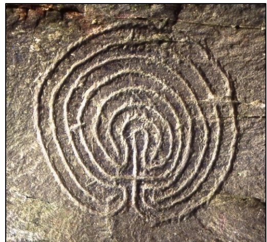
Top: inscription, Luzzanas, Sardinia Middle: pottery, Tell Rifa’at, Syria Below: petroglyph, Rocky Valley, England