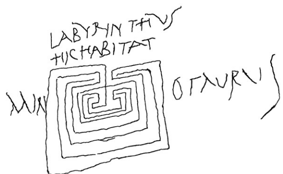
Top: petroglyph, Taouz, Morocco Middle: coin, Knossos, Crete Lower: Graffiti, Pompeii, Italy

The legend of Theseus and the Minotaur was evidently well known and popular with the Romans. Scratched on a pillar of a house at Pompeii, Italy, destroyed (and preserved) by an eruption of Vesuvius in 79 CE, is a labyrinth graffiti with an inscription reading LABYRINTHUS HIC HABITAT MINOTAURUS (the labyrinth, here lives the Minotaur). Possibly this was a reference to the disposition of the owner of the house!