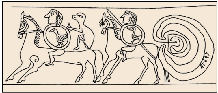
Inscription, Tragliatella, Italy

The depiction of a labyrinth on an Etruscan wine jar from Tragliatella, Italy, dating from the late 7 th century BCE, shows armed soldiers on horseback riding away from a labyrinth with the word TRVIA (Troy) inscribed in the outermost circuit. This popular connection between the labyrinth and the defences of Troy (and indeed other fabled cities) has continued throughout the history of the labyrinth, wherever it is found.