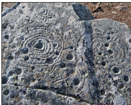
Top: Mogor, Galicia, Spain Middle: Chan do Lagoa, Galicia, Spain Lower: Lucillo, León, Spain