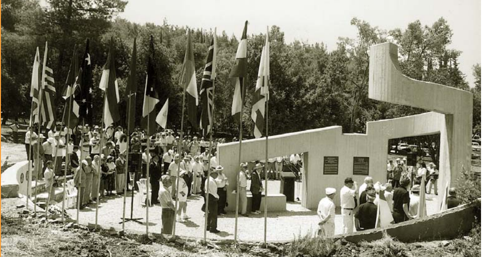
The dedication ceremony of the monument in memory of the 119 overseas volunteers who fell in the War of Independence.