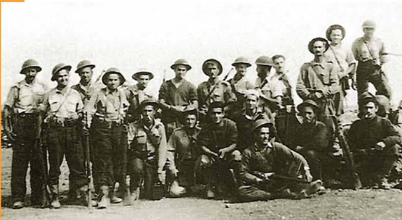
The South American platoon, 91st Battalion in the 9th Brigade.

The first overseas volunteers, several dozen men, arrived in Palestine as early as February 1948. (Twenty-four volunteers fell in battle by May 31, 1948.) The numbers of volunteers grew steadily as the day of the proclamation of the state drew nearer. There was a further spurt in the numbers after the first cease-fire, which ended in July 1948.