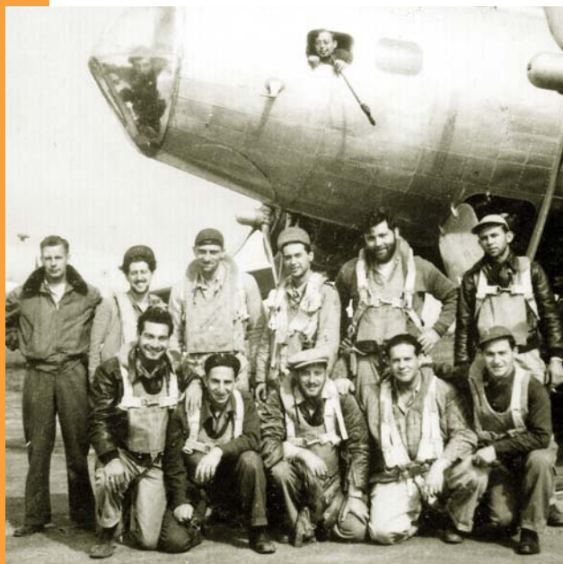
B-17 crew at Zatec, Czechoslovakia, before takeoff.

aircraft mechanics he trained, many of whom later assumed key positions of command.