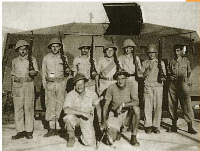
Crew of armored car, “Sandwich”, 3rd Brigade, with overseas volunteers from England, Norway, South Africa and the U.S.

There were also many Machalniks in the 8th Armored Brigade. They were part of a kaleidoscope of men recruited in various countries, speaking a medley of languages. In the heavy-tank company, commanded by Machalnik Clive Selby , English was the language of communication; in the light-tank units it was Russian. The commander of the 82nd Battalion (the only unit with tanks in 1948), spoke in Russian with the commander of the 8th Brigade, Yitzhak Sadeh, and in German with the deputy