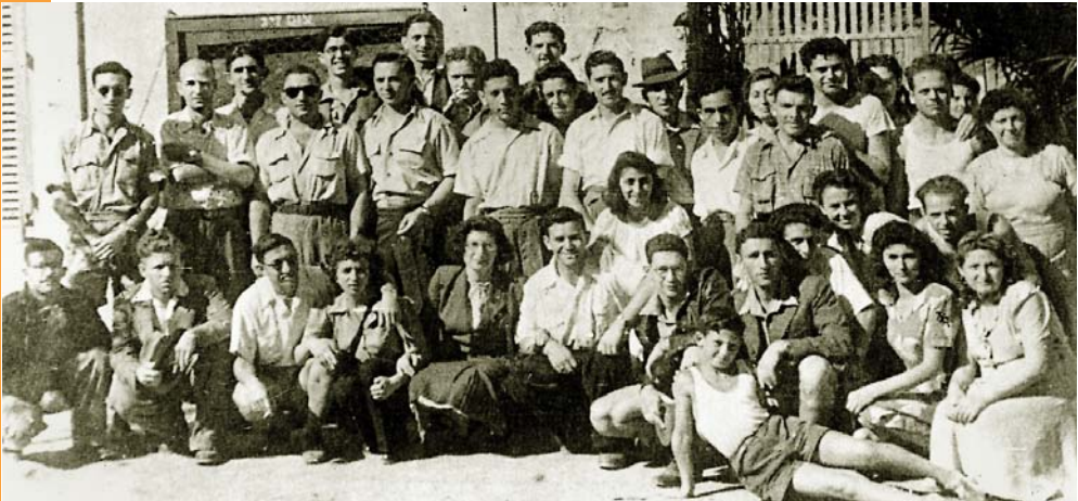
En route to Israel: A group of 25 South African volunteers from the Betar Zionist movement, together with refugees and staff at Ladispoli displaced persons camp, Italy, July 1948.

Machal veterans living abroad maintain ties with Israel through World Machal and its affiliates in many countries.