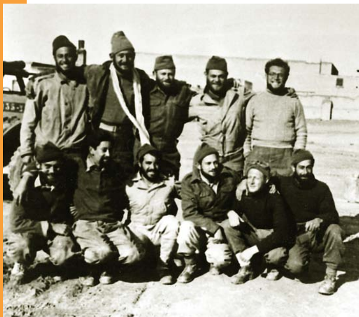
Machalniks of the Armored Car and Jeep Company, 9th Battalion, Palmach Hanegev Brigade, after the capture of Beer Sheba.

This 9th Armored Battalion had a considerable number of Machal English-speakers, including 22 South Africans. Volunteers from France