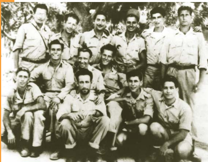
Machalniks who arrived on the Pan York in August 1948. Most were posted to the 7th Brigade.

The first volunteers, some 240 men, operated within the framework of the Mossad l'Aliyah Bet, the organization bringing "illegal immigrants" to Mandatory Palestine. Most of these volunteers were Americans, 16 were