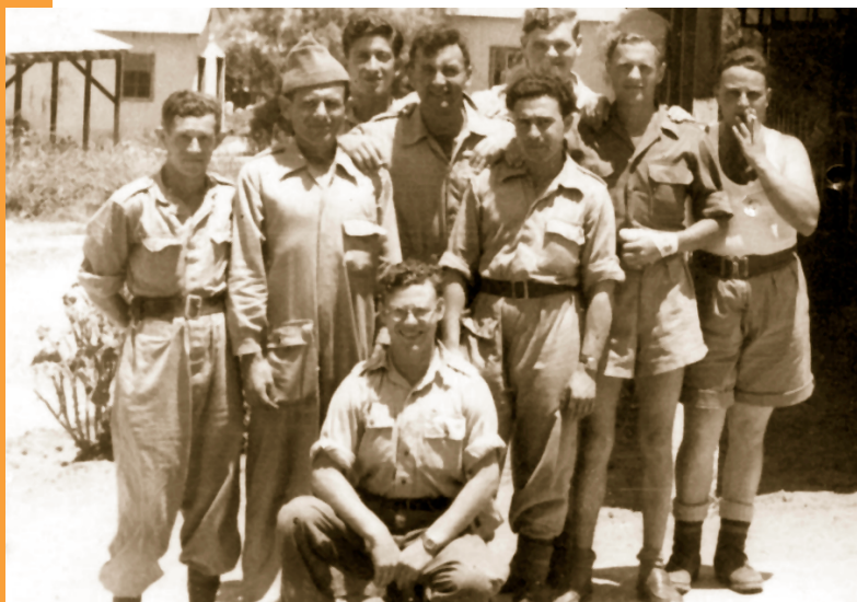
A group of Machalniks, mostly British, in the Alexandroni Brigade.

The overwhelming majority of the volunteers came from English-speaking countries and were generally posted to units according to their skills and war experience. Artillerymen, engineers, signalers and armored vehicle specialists were much in demand. Machal soldiers set up the first artillery units, which included heavy-mortars. From 15th May to early June 1948, British, South African, Canadians and some Americans were posted to the 3rd Brigade (Alexandroni), which also included volunteers from Holland, Denmark and New Zealand. Subsequently, Machalniks were posted to numerous other