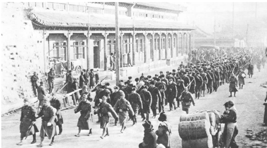
NORTH CHINA MARINES, en route to prison camp in Shanghai, are paraded through the streets of Nanking by their captors on 10 January 1942.