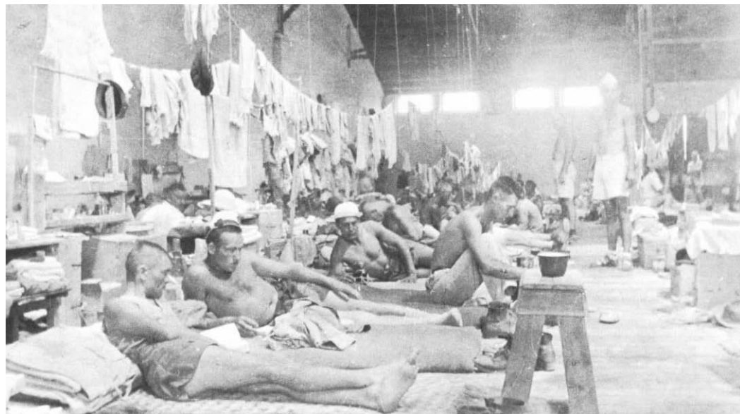
POW QUARTERS at Feng'ai, where the Woosung prisoners were held for a short time before being transferred to camps in Japan.