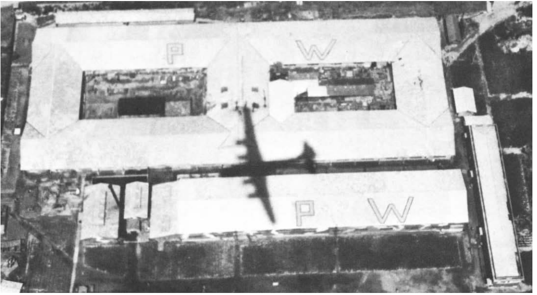
SHADOW of a B-29 on a supply-drop mission passes over the POW camp at Nagasaki. (USAF 58504)