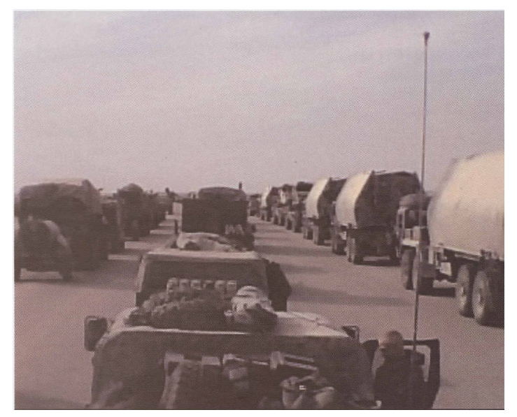
Pontoon bridges stage near Highway 1, ready to push to the Tigris.

English between their thumb and forefinger. These Syrian hardcore fighters were possibly linked to the terrorist training camp near the town.