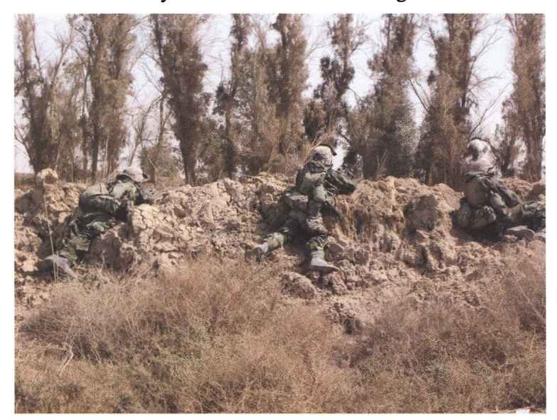
Marines take up positions near An Numaniyah to cover their fellow Marines as they near the Tigris River.

Elements of RCT-7 moved up to their attack positions on the south side of the Saddam Canal. They relieved RCT-5 of all of their remaining battlespace, and were poised to participate in the next day's attack across the Tigris River. With RCT-1 fixing the enemy, RCT-5