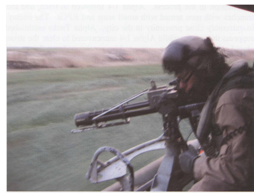
A door gunner provides cover with his minigun from a UH-1N.

The pace quickening, the Battalion Commander ordered a more deliberate approach, allowing situation to develop. While the lead elements continued their movement west into the city, Kilo Company dismounted to clear cluster of mud huts on the south side of the road. Approaching the town, Bravo established an attack by fire position on the eastern outskirts, allowing Kilo Company to maneuver around and aim for the