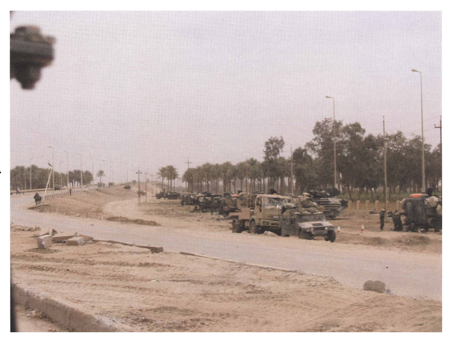
Third Battalion, 7th Marines, relieve 3/5 at the An Numaniyah Bridge.

The Marines from 2/1 would continue to play a significant role in stabilizing the An Nasiriyah battlespace over the next several days, conducting raids Baath party on buildings, Fedeyeen strongholds, military facilities, and other areas of potential resistance identified by intelligence. During combat operations and patrols, the battalion destroyed over thirty arms caches. Even though not operating under direct 1st Marine Division command. these Marines were instrumental in executing a 'No better friend, no worse enemy' policy on the streets