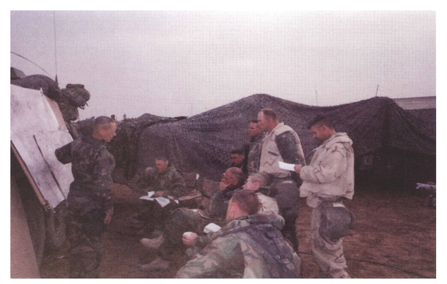
The CG provides guidance to his staff near An Numaniyah.

RCT-7 moved up to relieve 3/5 of the bridgehead, seize An Numaniyah Airfield, and establish blocking positions on both banks of the Tigris River. Entering the An Numaniyah Airfield, 1/7 seized it without incident. Third Battalion, 7th Marines, followed by 1<sup>st</sup> Tank