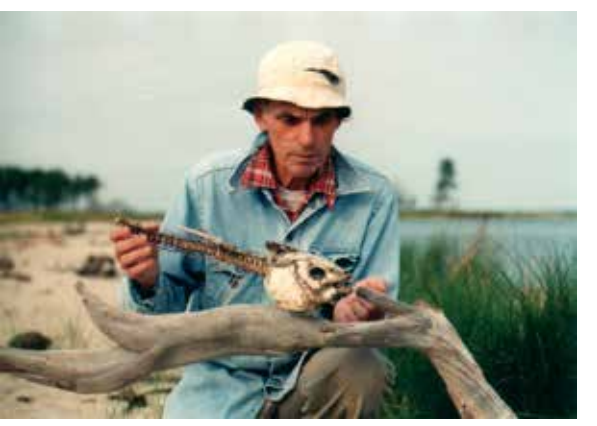
Always the scavenger.

frequently would travel the coastal areas of Maryland and Virginia in search of shore birds and waterfowl.