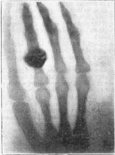
FIG. 1.—Photograph of the bones in the fingers of a living human hand. The third finger has a ring upon it.

I have observed and photographed many such shadow pictures. Thus, I have an outline of part of a door covered with lead paint; the image was produced by placing the discharge-tube on one side of the door, and the sensitive plate on the other. I have also a shadow of the bones of the hand (Fig. 1), of a wire wound upon a bobbin, of a set of weights in a box, of a