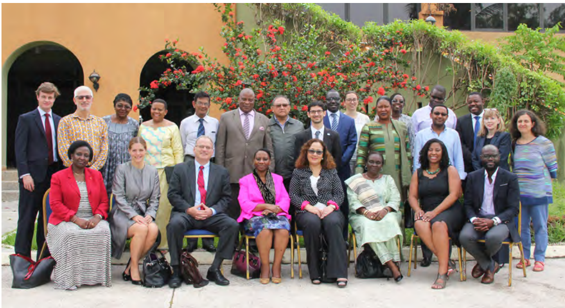
Participants at the Joint thematic dialogue on sexual orientation and gender identity African Commission on Human and Peoples' Rights, Inter-American Commission on Human Rights, and United Nations