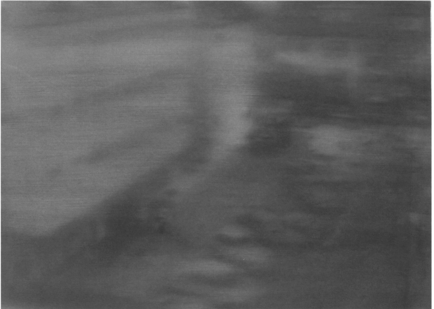
Arrest 2 (Festnahme 2), 1988. From October 18, 1977. Oil on canvas. 36¼ x 49¼ in. (92 x 126.5 cm). The Museum of Modern Art. Purchase.