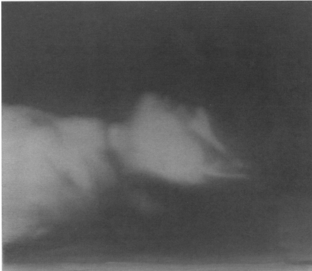
Dead (Tote) , 1988. From October 18, 1977 . Oil on canvas. 13¼ x 15½ in. (35 x 40 cm). The Museum of Modern Art. Purchase.