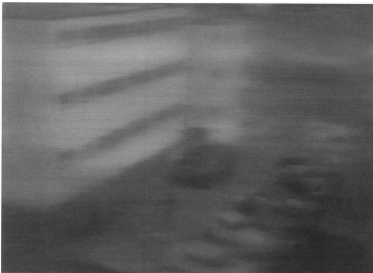
Arrest I (Festnahme I), 1988. From October 18, 1977. Oil on canvas. 36½ x 49¼ in. (92 x 126.5 cm). The Museum of Modern Art. Purchase.