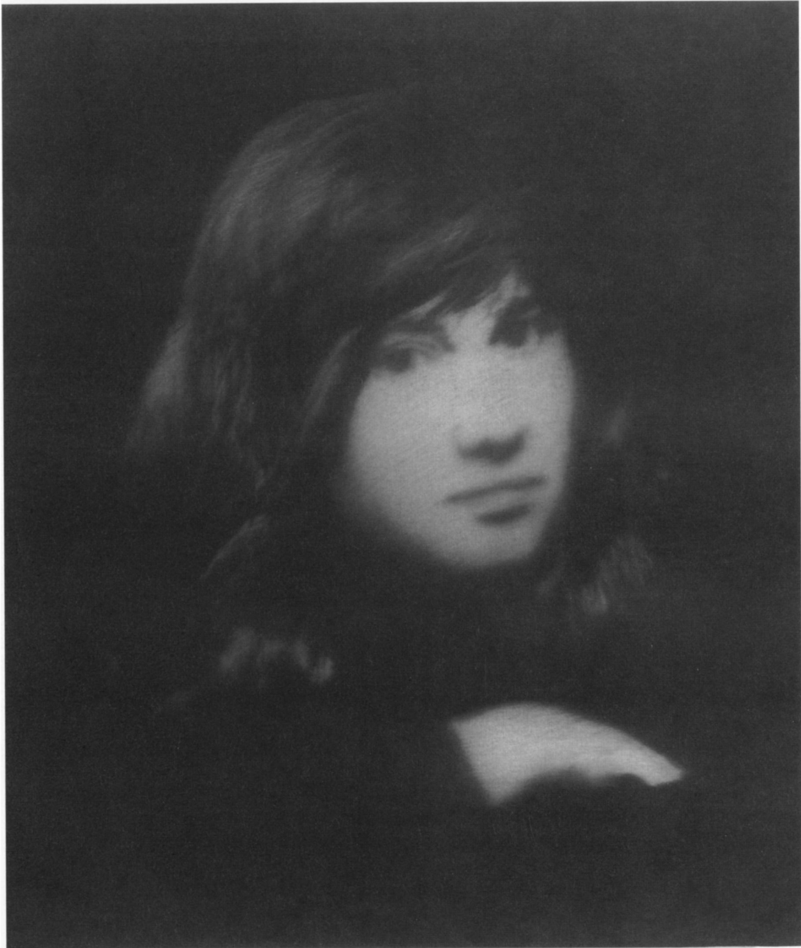
Youth Portrait ( Jugendbildnis ), 1988. From October 18, 1977. Oil on canvas. 28 \frac{1}{2} x 24 \frac{1}{2} in. (72.4 x 62 cm). The Museum of Modern Art. Purchase.