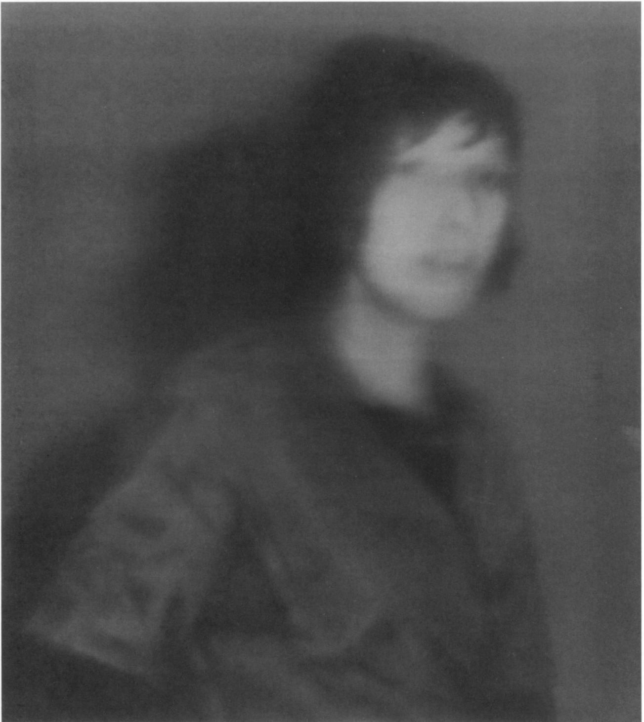
Confrontation 2 (Gegenüberstellung 2) , 1988. From October 18, 1977 . Oil on canvas. 44 x 40¼ in. (112 x 102 cm). The Museum of Modern Art. Purchase.