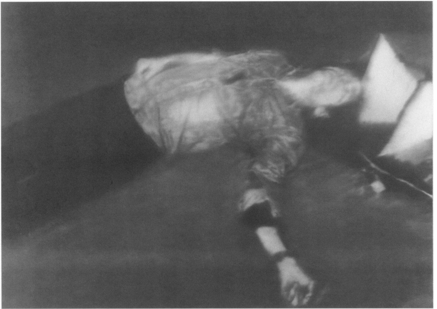
Man Shot Down I (Erschossener I) , 1988. From October 18, 1977 . Oil on canvas. 39½ x 55¼ in. (100.5 x 140.5 cm). The Museum of Modern Art. Purchase.