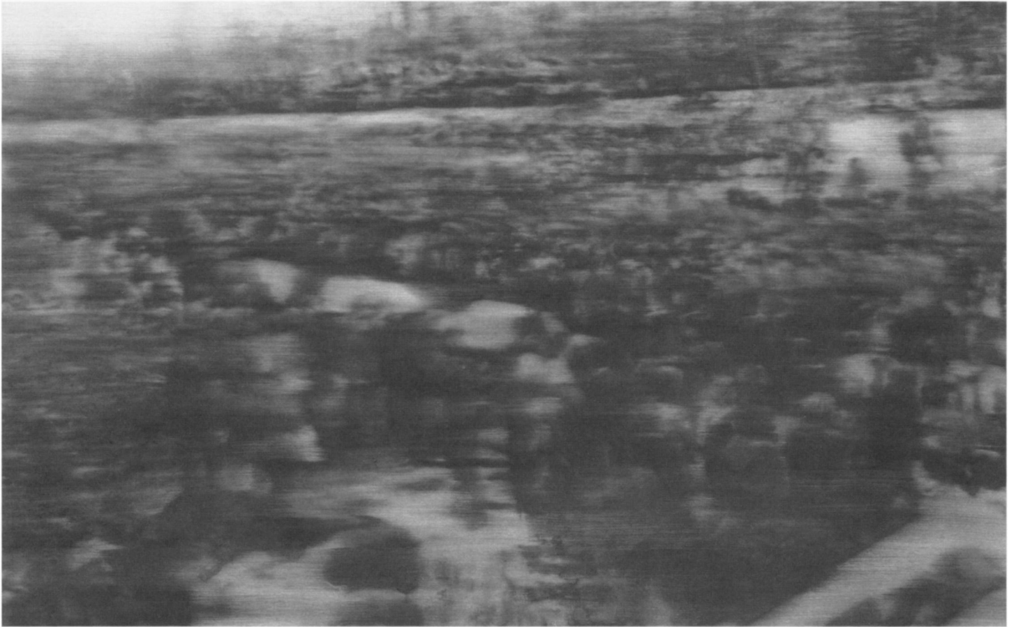
Funeral (Beerdigung) , 1988. From October 18, 1977 . Oil on canvas. 6 ft. 6¼ in. x 10 ft. 6 in. (2 x 3.2 m). The Museum of Modern Art. Purchase.