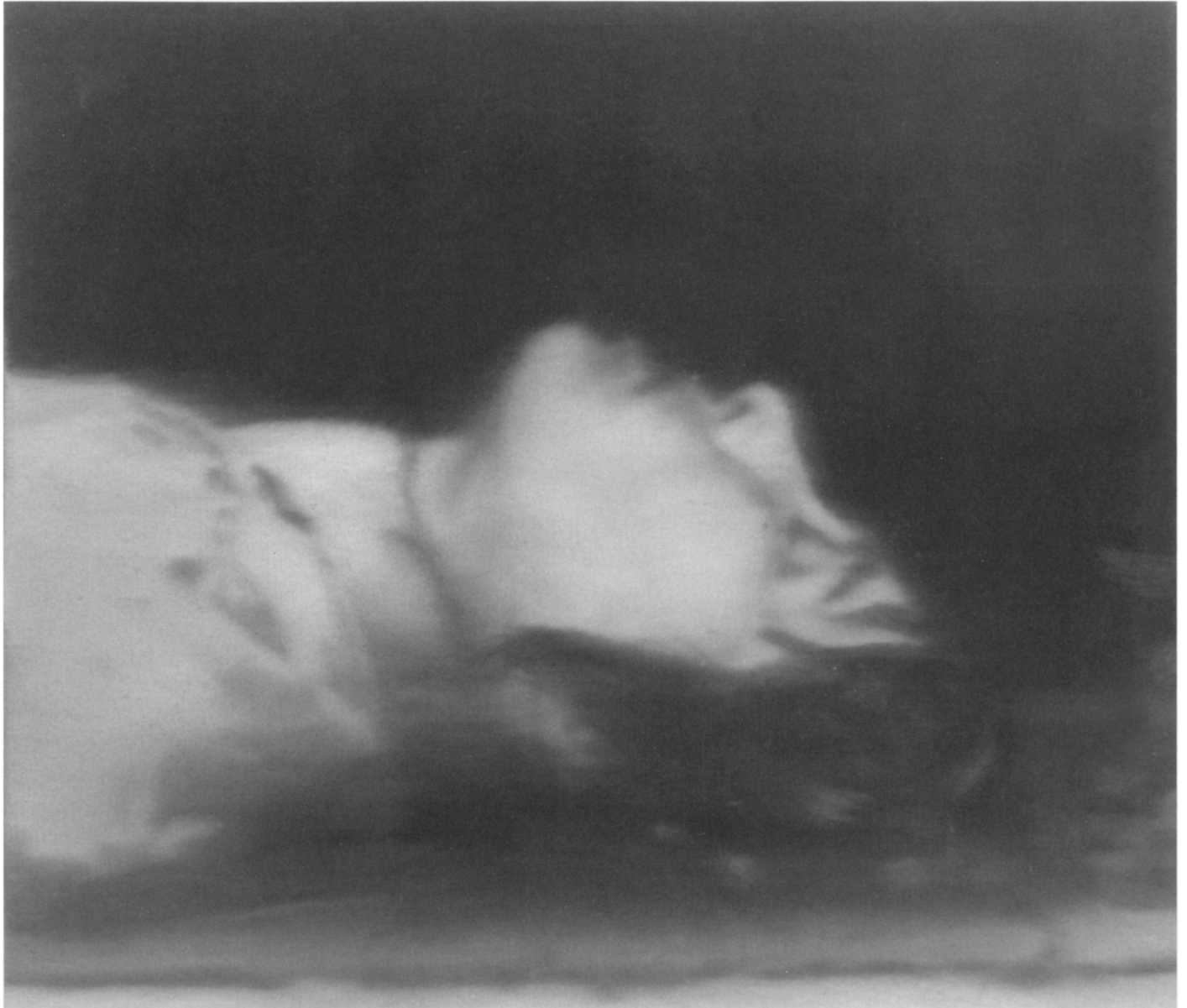
Dead (Tote), 1988. From October 18, 1977. Oil on canvas. 24½ x 28¾ in. (62 x 73 cm). The Museum of Modern Art. Purchase.