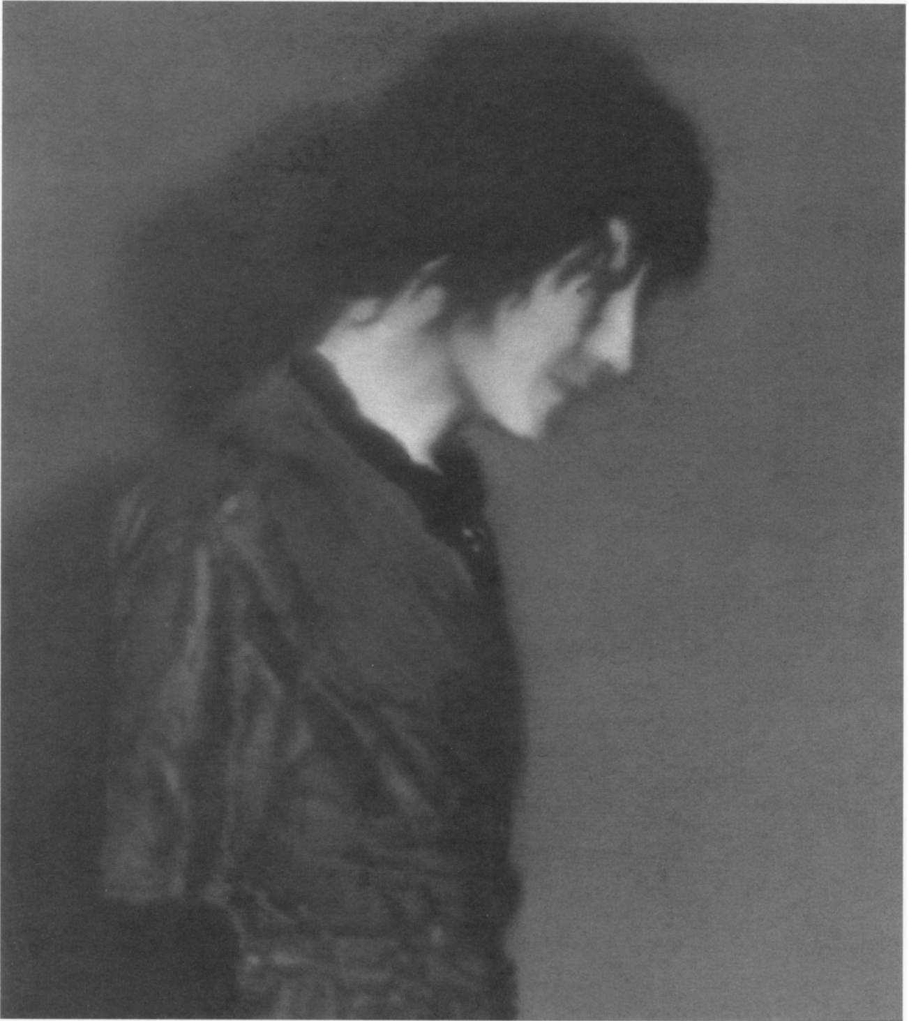
Confrontation 3 (Gegenüberstellung 3), 1988. From October 18, 1977 . Oil on canvas. 44 x 40¼ in. (112 x 102 cm). The Museum of Modern Art. Purchase.