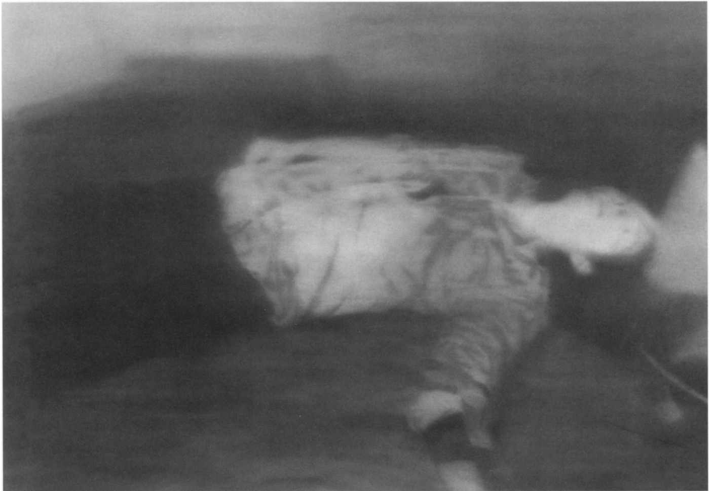
Man Shot Down 2 (Erschossener 2), 1918. From October 18, 1917 . Oil on canvas. 39½ x 55¼ in. (100.5 x 140.5 cm). The Museum of Modern Art. Purchase.