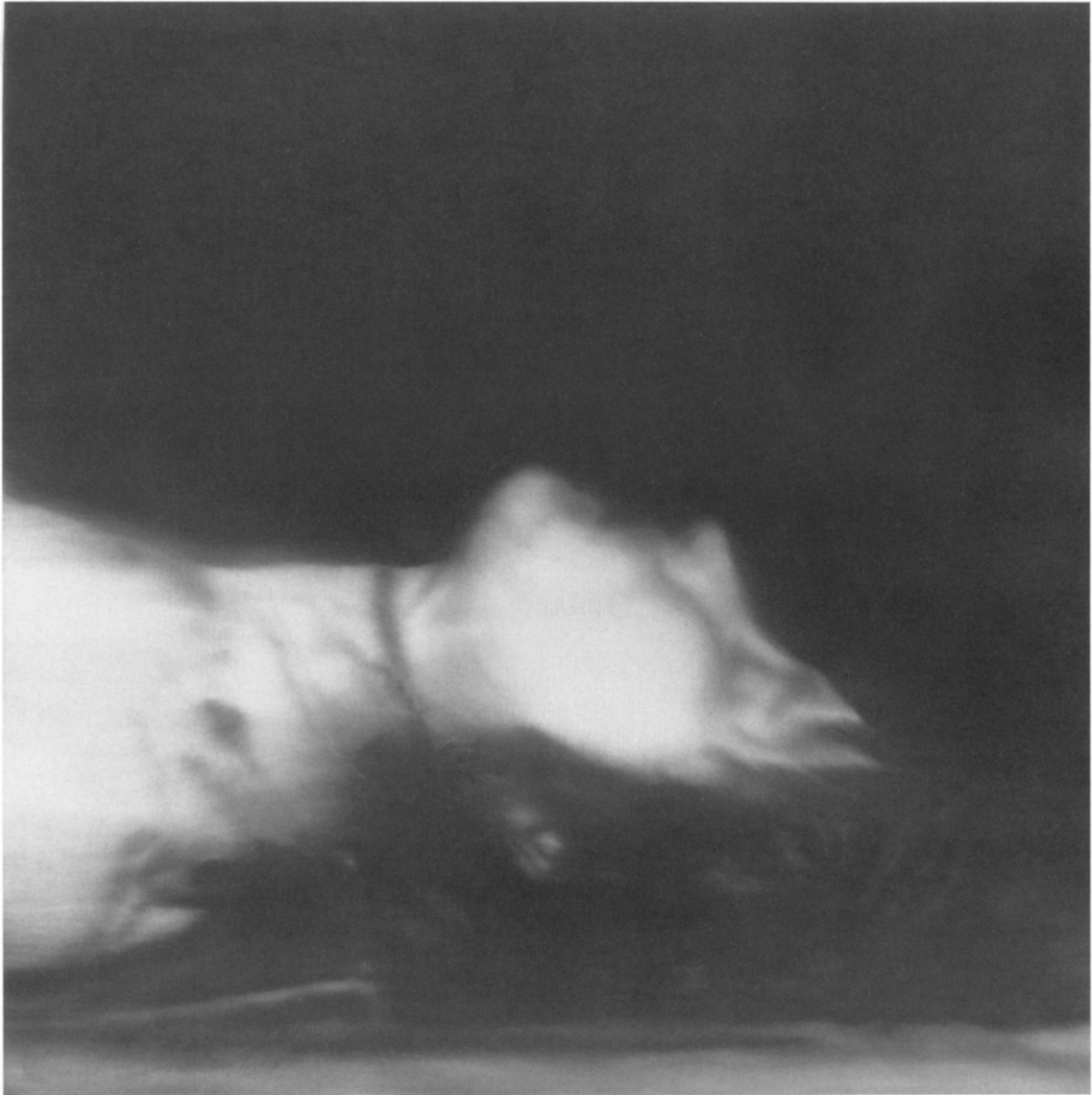
Dead (Tote), 1988. From October 18, 1977. Oil on canvas. 24½ x 24½ in. (62 x 62 cm). The Museum of Modern Art. Purchase.