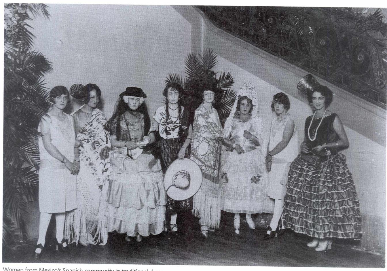
Women from Mexico's Spanish community in traditional dress

After 1939, a new wave of Spanish immigrants came to Mexico. Republican refugees from the Spanish Civil War.