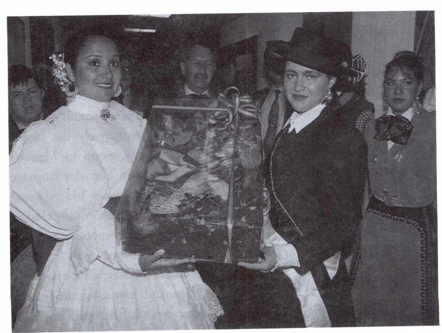
The first May roses to bloom in Madrid's Retiro Park are sent to Mexico's Spanish community, which takes them as an offering to Our Lady of Guadalupe in Mexico City.

Spaniards were the victims of the Mexican Revolution's xenophobia, although they were never the brunt of the kind of aggression suffered by