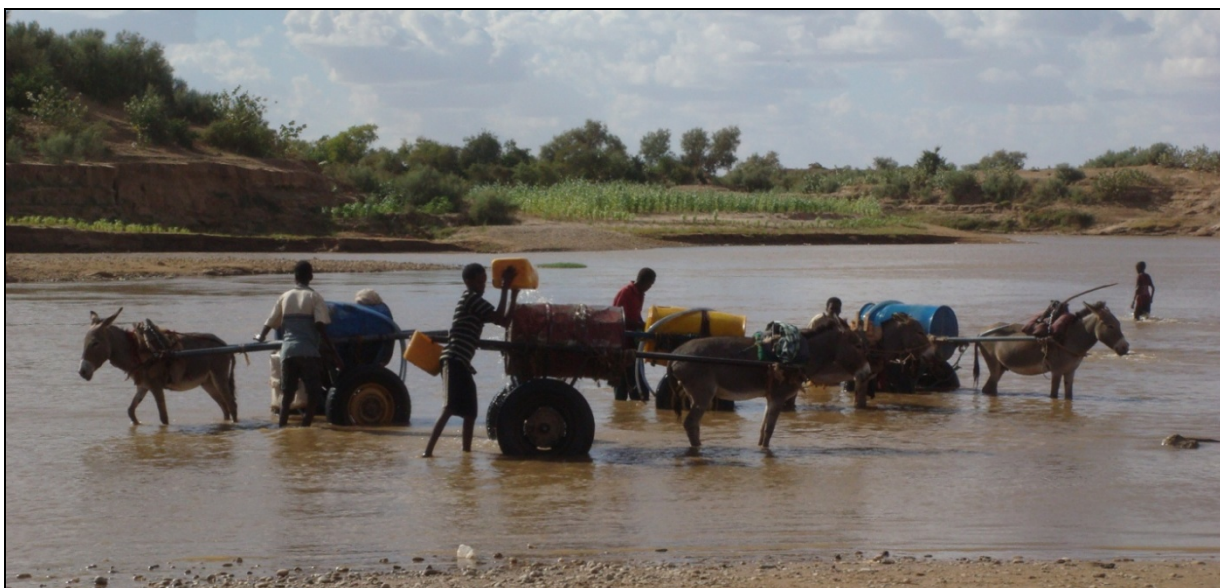
Boys collecting water with donkey carts.

"Girls as young as 14 go to Djibouti to work as domestic labourers. Some are sent by their parents and others go by themselves. Some mothers bring their daughters back home when they find out that they are working as a slave." (Women's group member, Mieso-Mulu woreda )