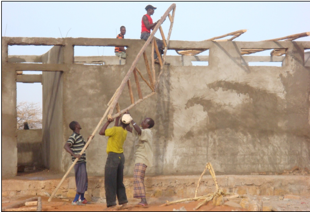
Construction of a new school in Hargelle woreda

"Everyone is focussing on girls nowadays and it has paid off. There is now equal enrolment of girls and boys in our town". (Women's group member, Hargelle woreda)