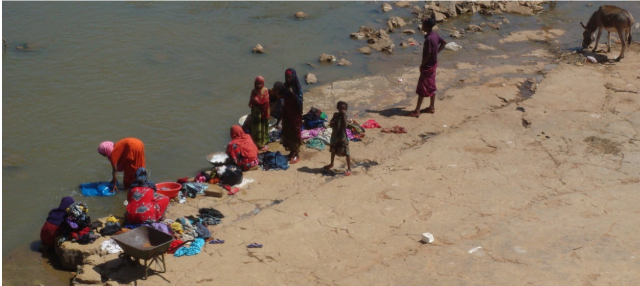
Girls doing the laundry in a river

for the family. In Gode the presence of a few street children was reported and it was mentioned that some children who came to town for work are spending the night in the mosque. Several participants described the existence of a strong support system at family and sub-clan level. Different traditional forms of assistance exist in Somali communities, including loans and gifts of food, cash and livestock, as well as a compulsory contribution in Islam called zakat 25 .