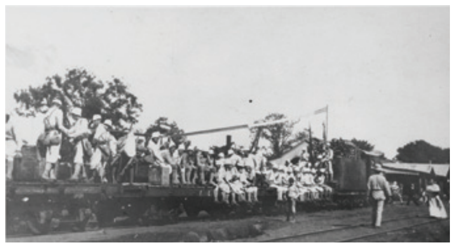
Landing party from USS Denver (C-14) traveling on the Ferro Carriel de Nicaragua, 1912. U.S. forces quickly moved out from their initial lodgment at Corinto to seize control of the national railroad.

On August 3, the Díaz government advised U.S. Minister George T. Weitzel that it could not assure the safety of U.S. lives and property in Nicaragua. The Díaz foreign ministry requested armed assistance from the United States to protect not only United States citizens but "all the inhabitants of the [Nicaraguan] Republic."<sup>17</sup>