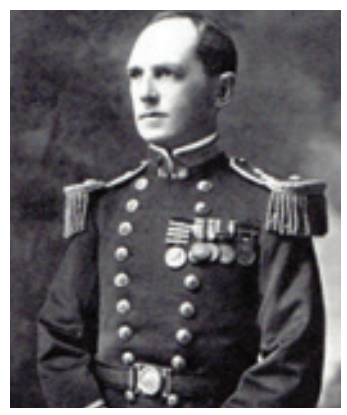
Lieutenant Commander William D. Leahy, USN, in 1916—four years after he participated in the Nicaraguan intervention of 1912.

The morning of Thursday August 29, 1912, signified an auspicious moment for Nicaragua. As the first rays of sunlight dissipated the predawn gloom, 400 U.S. sailors and marines assembled at the railroad terminal in Corinto, a small entrepôt situated on Nicaragua's Pacific coast. The landing party quickly entrained to move inland as revolutionary violence convulsed the Central American nation. The vanguard of a larger expeditionary force due to arrive within days, this advance battalion wasted no time positioning itself to protect foreign lives and property across western Nicaragua—with the U.S.-owned national railway as its primary