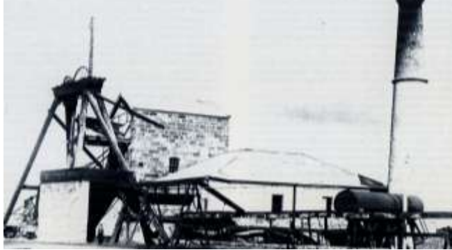
The stone building from the Cornwall Mine near Kadina, re-erected at the Elder Shaft at the Wallaroo Mines

Kabininge - This name is shown thus on early maps and means 'bad water place' and on latter-day maps it appears as Kabininye . Situated three kilometres south of Tanunda, it was said to mean 'morning star'. Prior to 1918 it was known as 'Kronsdorf', this name, with a slight modification, was restored to the map as 'Krondorf' in 1975.