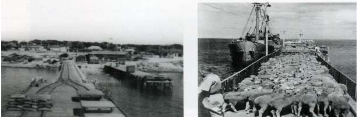
Kingscote's jetties - circa 1930