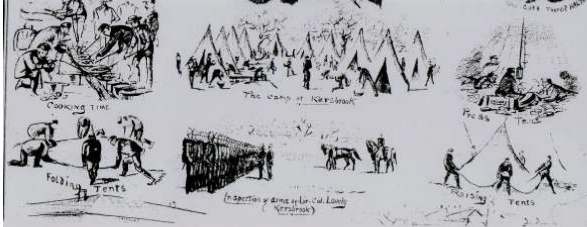
The Riflemen's Campaign at Kersbrook - May 1881

Kersaint, Cape - On Kangaroo Island, and shown first on Freycinet's charts, recalls Armand, Comte de Kersaint (1747-1782), a 'politician and writer... accused of conspiring to restore the monarchy and executed.'