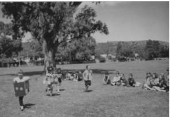
Students assisting in the landscaping of the Mitcham School grounds in 1979