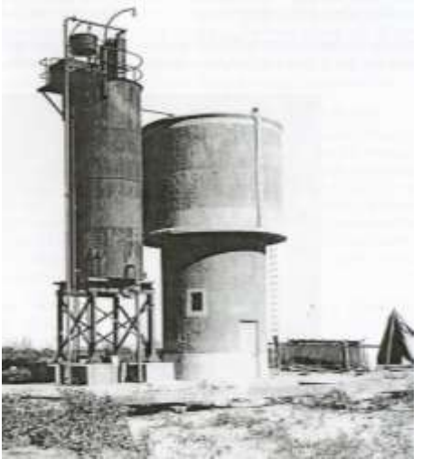
Water softener at Karoonda - 1914

Karoonda – This place was a former Aboriginal camp on a trade route and is derived from the Aboriginal karunda , meaning 'winter's camp'.