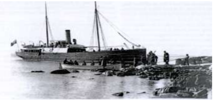
SS Musgrave at Kirton Point – circa 1900