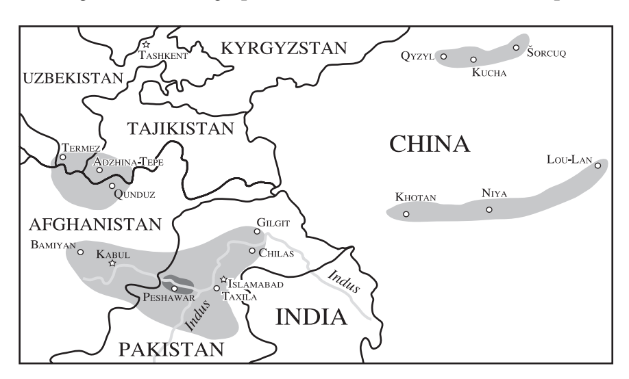
Figure 10-5. Geographical Extent of the Kharoshthi Script

Formal Kharoshthi and was used to write both Gandhari and Tocharian B. Representation of Kharoshthi in the Unicode code charts uses forms based on manuscripts of the first century CE.