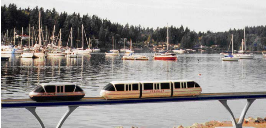
Illustration 4 Urbanaut® Monorail on an Elevated Guideway

A typical one is the new monorail technology trade named Urbanaut® , which has a unique central guide rail on top of the beamway that prevents uplift and derailment of the vehicle . (Illustration 4) There is extensive information on this new monorail technology on the website "urbanaut.com". The Urbanaut® needs only a concrete runway slab at surface and is approximately half the size and weight of the Alweg. Urbanaut® has the smallest and least costly cross-section area requirement in capacity comparison of any comparable elevated surface or subsurface transit. Switching of the Urbanaut® is done by simply flexing the central rail.