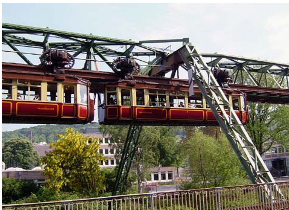
Illustration 1 Wuppertal Monorail

An example is the Wuppertal Monorail in Germany. This is perhaps the oldest of all monorails and is still in operation (Illustration 1)