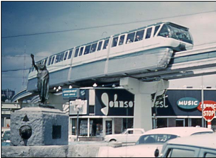
Illustration 2 Alweg Monorail on an Elevated Guideway

A typical and most applied monorail world wide is the Alweg Monorail Concept, which envelopes and straddles a narrow deep beamway. The Alweg vehicle is supported by 2 bogies, each having load bearing wheels on the top of the beam, and is guided by 2 rows of stabilizing wheels along each side of the beamway . In this concept the beamway is an essential part of the vehicle system either when elevated or at surface (Illustrations 2 and 3). Switching of the Alweg is complicated and involves flexing the massive beamway. The first full size Alweg system was installed in Turin, Italy, 1956, then in Seattle, USA 1962 and several in Japan later.