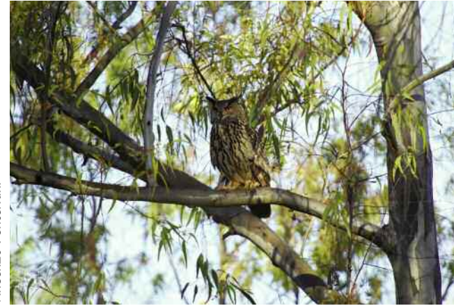
65. Breeding female Eagle Owl Bubo bubo close to a nest in Doñana, February 2007.

respectively). The mean frequency of owls in the diet was 2.5% (mean value for Europe 2.4%; Lourenço et al. 2011), corresponding to a biomass contribution of 2.4%. Barn Tyto alba and Tawny Owls each accounted for 0.9% of total biomass.