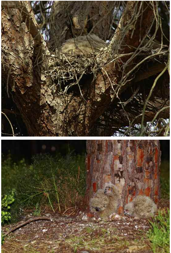
63 & 64. Most of the Doñana Eagle Owls Bubo bubo use stick nests built by other raptors (adult on nest here in May 2004) but ground-nesting pairs are not uncommon (two young at a nest in May 2007).

Predators, both birds and mammals, were relatively rare in the diet of the Doñana Eagle Owls; we recorded seven species of diurnal and four species of nocturnal raptor in prey remains. The mean frequency of diurnal raptors in the diet was 2.7% (of the items identified), somewhat higher than the mean value recorded for Europe of 1.2% (Lourenço et al. 2011), which translated into a biomass contribution of 5.0%. The most commonly predated diurnal raptors were Black Kites, Red Kites and Common Buzzards Buteo buteo (2.6%, 0.9% and 0.5% of total biomass,