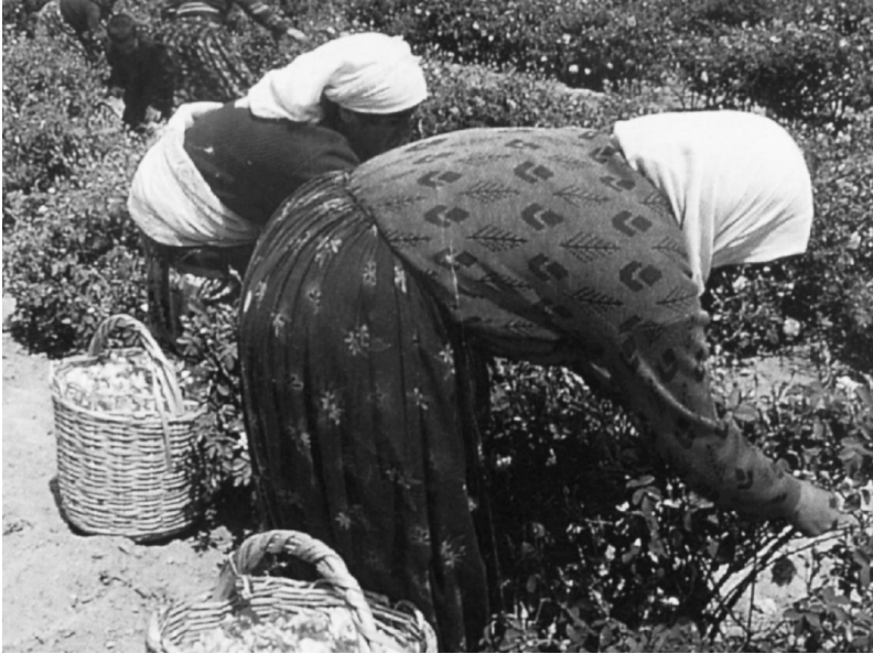
THE NEW CIVIL CODE RECOGNIZES THE HITHERTO INVISIBLE LABOR OF WOMEN WORKING FOR THEIR FAMILIES.

declare their decision in writing while applying for authorization to marry.