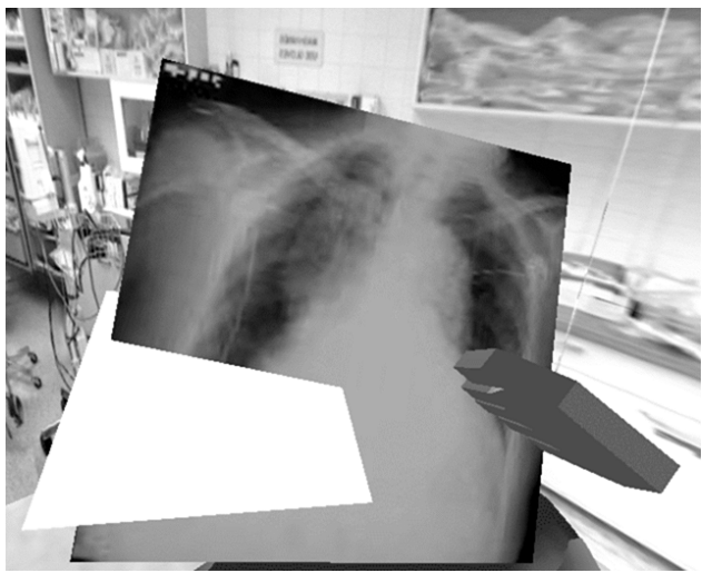
Figure 4. The user can grab document from VE and "bind" it into the virtual notepad by intersecting virtual notepad with the document and pressing a button.

3.2.2 Modifying notes in the virtual notepad. Mistakes by users while taking notes are inevitable, and editing and stroke manipulation gestures (meta-strokes) are therefore provided to allow for correction and modification of input [8]. In the current implementation of Virtual Notepad, we provide the user with a simple gesture for removing any individual stroke or set of strokes in the notepad. To remove unwanted strokes, the user simply flips the pen and erases them, by wiping the surface of the virtual notepad with the "eraser" located on the other end of the pen. As the eraser crosses a stroke, that stroke is removed (Figure 3). The red line indicating the path of the "eraser" on the notepad disappears when the user removes the pen from the tablet, cueing the end of the operation. Informal evaluation of Virtual Notepad has shown that this technique is intuitive and easy to use, since it capitalizes on our everyday experience with real pencils and paper. The ability to erase strokes seems sufficient for this application. If erasure is easy, it is much simpler to remove and rewrite faulty strokes than it would be to modify them.