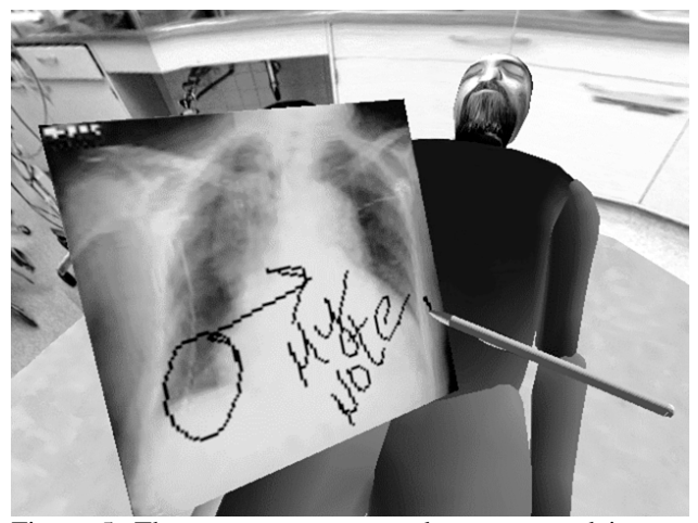
Figure 5. The user can annotate documents and images added to the virtual notebook. The digital ink approach allows for easy combination of notes and drawings.

3.2.3 Adding/removing pages in the virtual notepad. The user can have as many pages in the virtual notepad as desired. These can be clean pages, pages with notes scribbled previously, or images and documents added to the notepad. Real-world documents can be added to the virtual notepad in either an off-line mode or while inside the VE. For example, if an architect wants to bring the plans of a building into the VE where this building is being evaluated, then she can scan the plans and instruct Virtual Notepad to add them when the application starts. If documents are already located in a VE, then the immersed user can simply grab them with the virtual hand and "bind" them into the virtual notepad. Binding can be performed by intersecting the virtual notepad with the desired document and pressing a button (Figure 4). Virtual Notepad