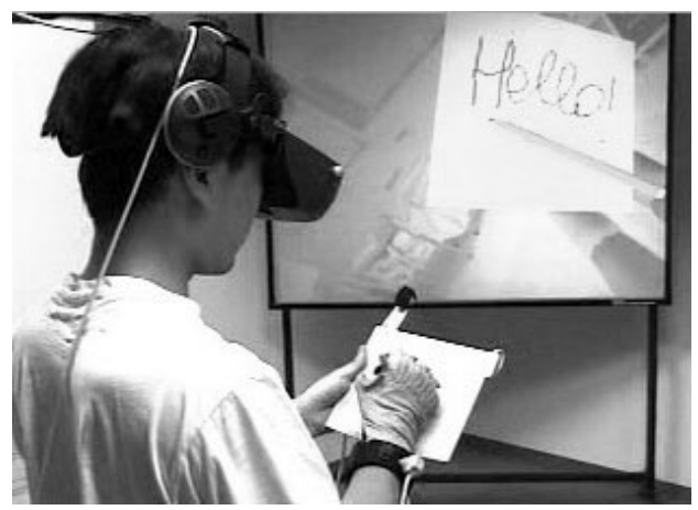
Figure 1. The physical setup of Virtual Notepad. The user is provided with a spatially-tracked tablet and pen for taking notes in the VRER.

Two major modes of interaction are supported. While the user is not touching the tablet with the pen, a virtual representation of the user's hand is provided so that the user can interact with objects in the VE as usual. When the participant touches the real tablet with the real pen, then Virtual Notepad is activated and the virtual hand is replaced with a virtual pen, which appears on the virtual notepad in the position corresponding to the position of