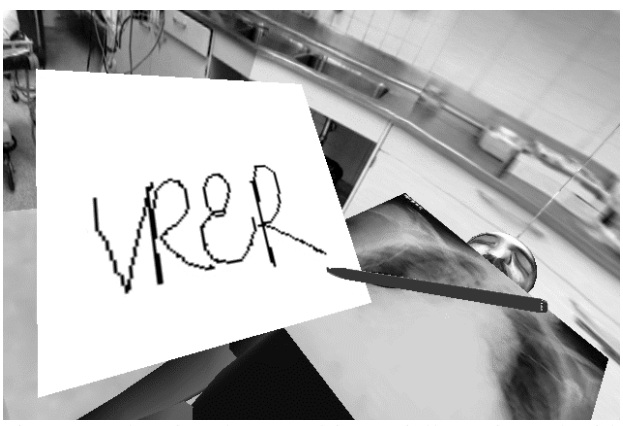
Figure 2. The virtual notepad is spatially registered with the physical tablet. When the user draws on the physical tablet, the virtual pen "draws" on the virtual notepad.