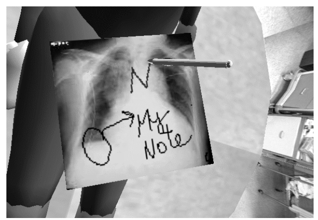
Figure 7. Handwritten commands are used to flip the virtual notepad's pages. The user writes "N" to access the next page of the notepad.

therefore filtered to remove excess data. Increasing the resolution of the virtual notepad currently increases the lag between writing on the real tablet and the appearance of the writing on the virtual notepad. Initial evaluation shows that the current resolution is sufficient for simple note taking, since it allows for about 15-20 symbols per row of the notepad.