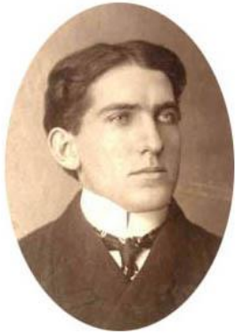
1897 Arbutus Yearbook Indiana University