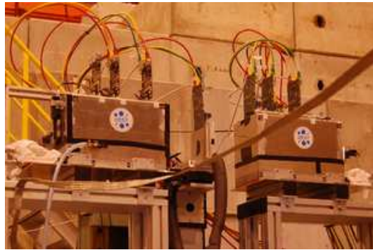
Figure 1: The EUDET pixel telescope installed at the CERN hadron test beam.

The construction of the telescope is performed in two steps. In June 2007, the so-called demonstrator telescope was installed for the first time using an analog readout. After the first successful operation at the electron beam at DESY, the demonstrator was transported to CERN and its performance was studied using 180 GeV hadrons at the SPS [3]. After the first successful integration of a Device Under Test (DUT) in September 2007 [4], the demonstrator telescope has been used by various groups and was improved continuously.