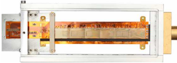
Figure 1: Front-view picture of the first full-size PLUME ladder hold in its test support frame. The connector appears on the left side, while the copper piece on the right is the air-inlet for the cooling.

After a very first prototype in 2009 [4], the first full-scale ladders were designed and fabricated in 2011. The micro-cables are made of two 20 \mu\text{m} thick metal layers of copper interleaved with 100 \mu\text{m} thick polyimide. The signal routing focused on electrical safety and resulted in a cable quite wider (24 mm) than the sensor. The spacer material was chosen as silicon carbide foam [3] with an 8 % density, its width slightly oversized with respect to the sensors for geometrical reasons and to ensure maximal stiffness. The main figures of this ladder, pictured in Figure 1, can be summarized as follow: 8 M pixels, mass 10 g equivalent to 0.6 % X_0 (cross section) and sensitive surface of 12.7 \times 1.1 \text{ cm}^2 .