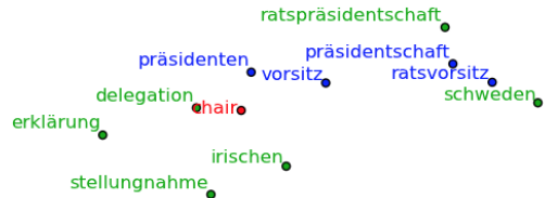
Figure 1: A visualization of the expected representation of the translated English word chair among the nearest German words: words never aligned (green), and those seen aligned (blue) with it.

We presented a new probabilistic model for learning bilingual word representations. This distributed word alignment model (DWA) learns both representations and alignments at the same time. We have shown that the DWA model is able to learn alignments on par with the FASTALIGN alignment model which produces very good alignments, thereby determining the efficacy of the learned representations which are used to calculate