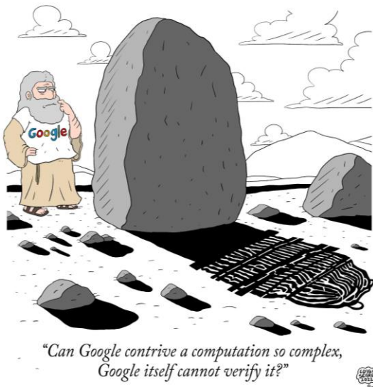
Figure 1. Cartoon illustrating the quantum supremacy version of the omnipotence paradox.

Public cryptocurrency networks, such as Bitcoin, maintain an immutable, decentralized ledger of transactions in electronic currency. Albeit the past attempts to establish e-cash systems, the Bitcoin's architecture (outlined in the original Nakamoto whitepaper [1]) was the first one to solve the double-spend [2] and the Sybil attack [3] problems through the clever use of Hashcash [4] and Proof of Work (PoW) [5]. The continued reliability and relative stability of the Bitcoin network throughout its massive growth over the past decade has made Bitcoin a real contender for the status of "world currency."