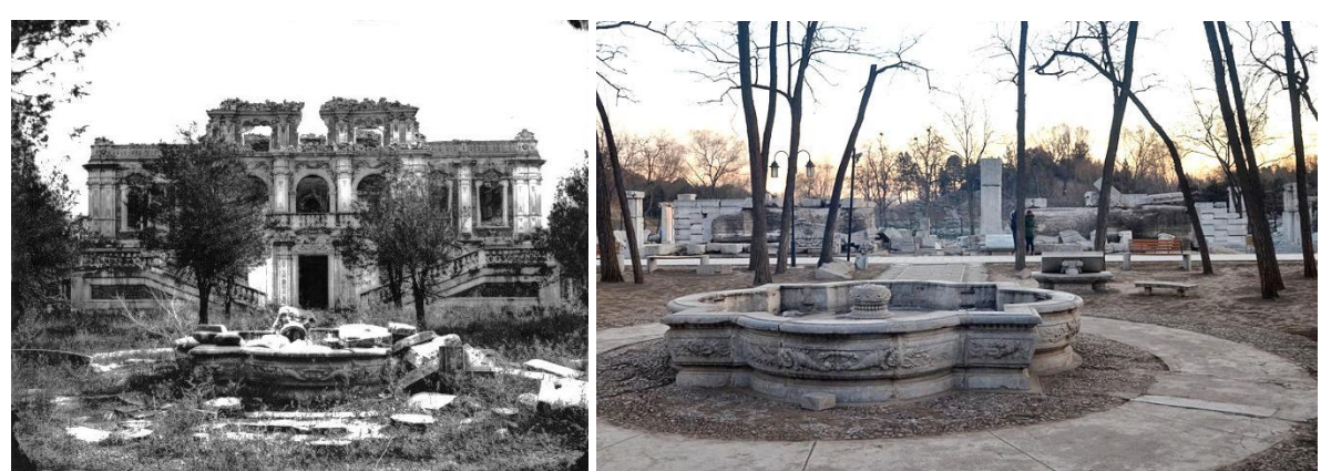
Figure 3: The north side of the Xieqiqu with the rests of the spring fountain, photograph E. Ohlmer, 1873 (from: Beijing World Art Museum, Qin Feng Studio 2010, p. 51); Figure 4: the same view today (Creative Commons License BY-SA; foto by 颐园新居, 2013)

the water jet of a spring fountain and describes how the ideal of a compact, transparent and uniform jet can be obtained through precise engineering (Bélidor 1739, pp. 392-397 and p. 412). These artistic aspects can, however, just be mentioned here, but this much can be added: It is this art-engineering-interaction through which the Western Fountains were integrated into Chinese culture. Hui Zou puts it like this in his 2011 book publication: "The water method of a fountain was a transformation of a Western fountain and it held its own meanings through its 'view' in the Chinese context" (Hui Zou 2011, p. 123). This was mostly done through poems, which describe the feelings of the spectator (in this case the Emperor). The water jet, which shows stability in movement, became a metaphor for the harmony in a society and watching water features in the garden became part of symbolic actions of the Emperor, which reminded him that it was his goal to care for the happiness of the population (Hui Zou 2011).