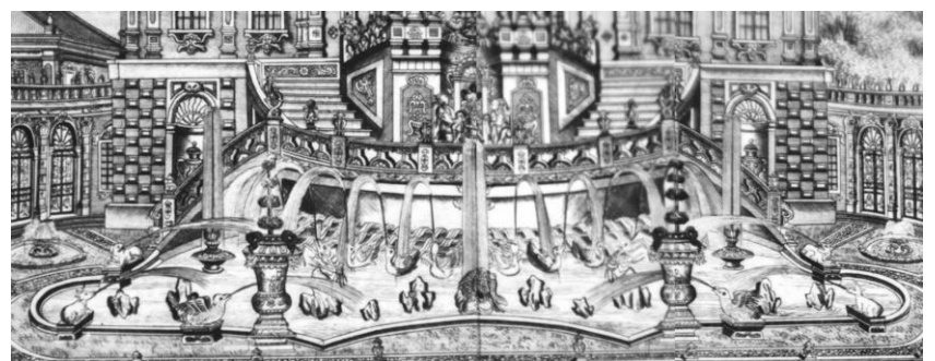
Figure 5: Xieqiqu, south side with spring fountains and plays of water; etching, 1783, detail