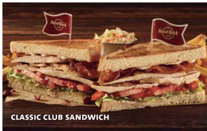
CLASSIC CLUB SANDWICH

*Consuming raw or undercooked hamburgers, meats, poultry, seafood, shellfish or eggs may increase your risk of foodborne illness, especially if you have certain medical conditions.