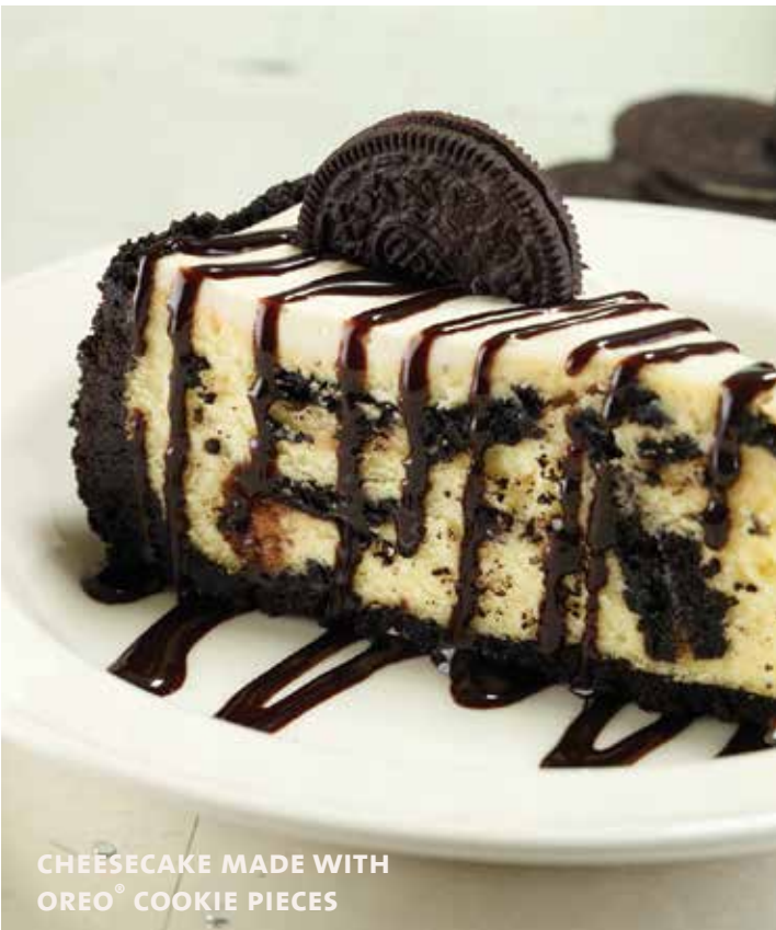
CHEESECAKE MADE WITH OREO® COOKIE PIECES