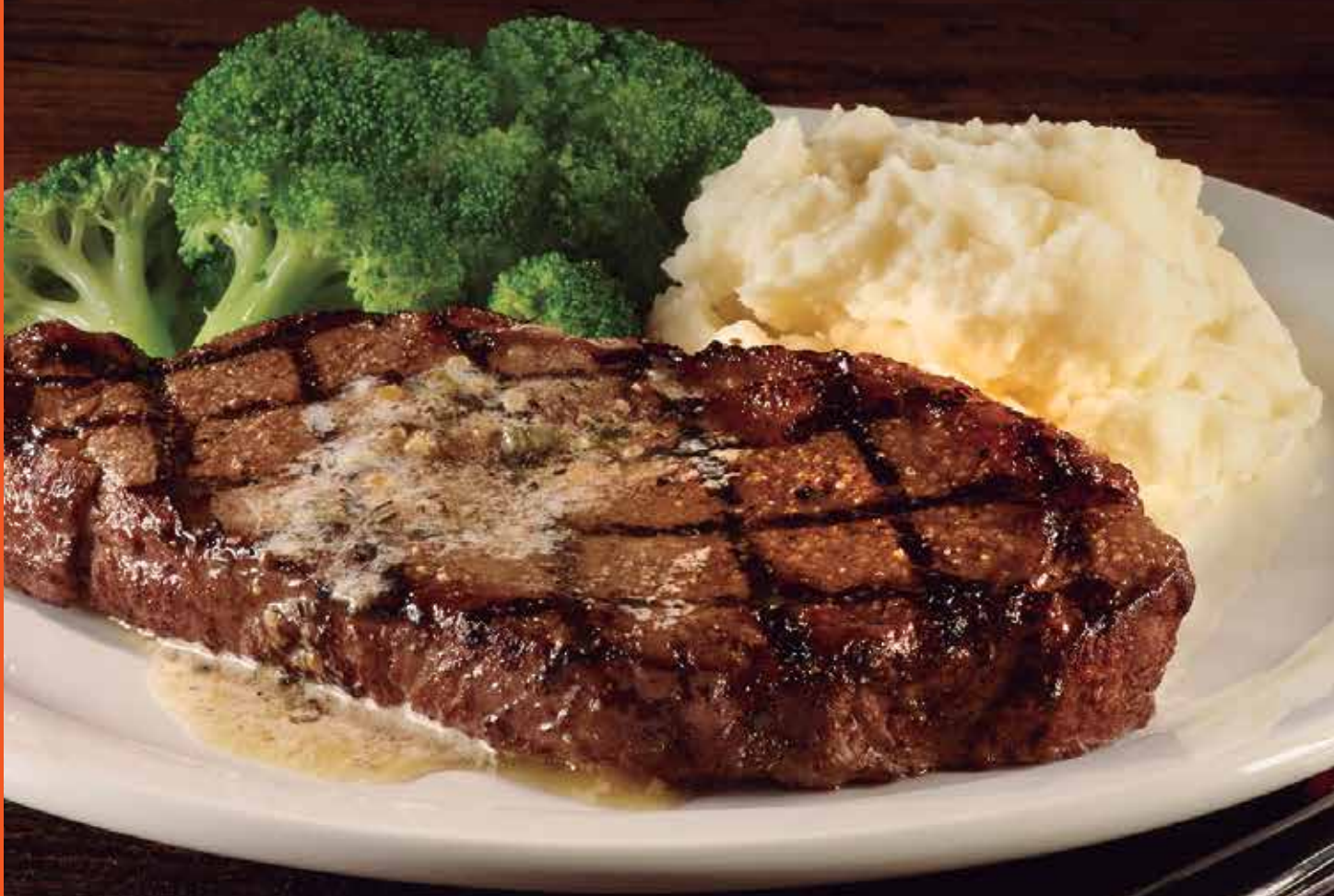
NEW YORK STRIP STEAK