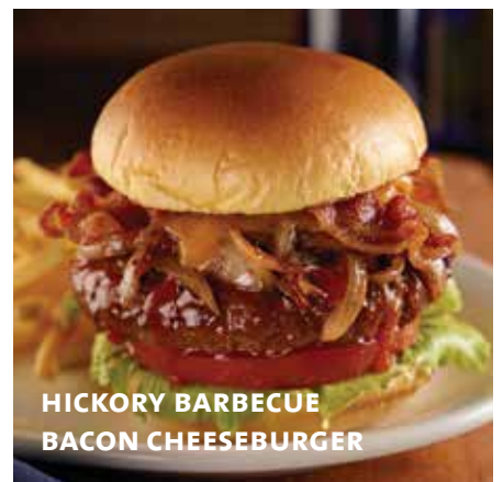
HICKORY BARBECUE BACON CHEESEBURGER