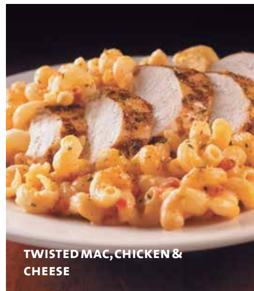
TWISTED MAC, CHICKEN & CHEESE