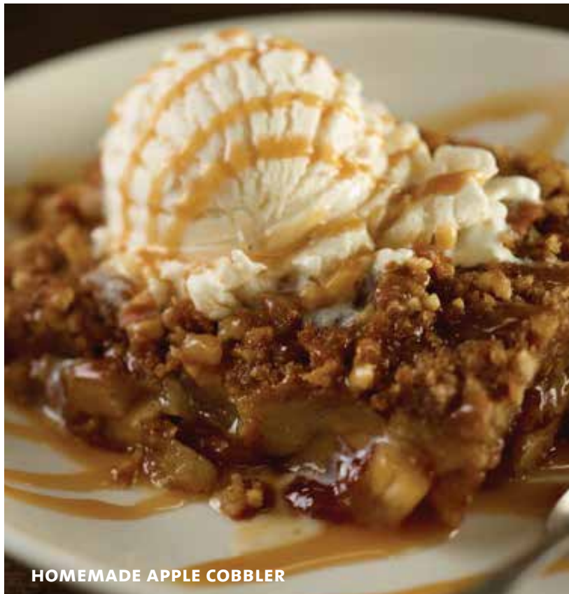
HOMEMADE APPLE COBBLER