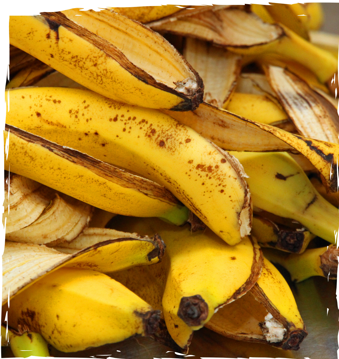
WASTE: Low-carbon liquid fuels made from waste are sustainable liquid fuels with no or very limited net CO 2 emissions during their production and use compared to fossil-based fuels.