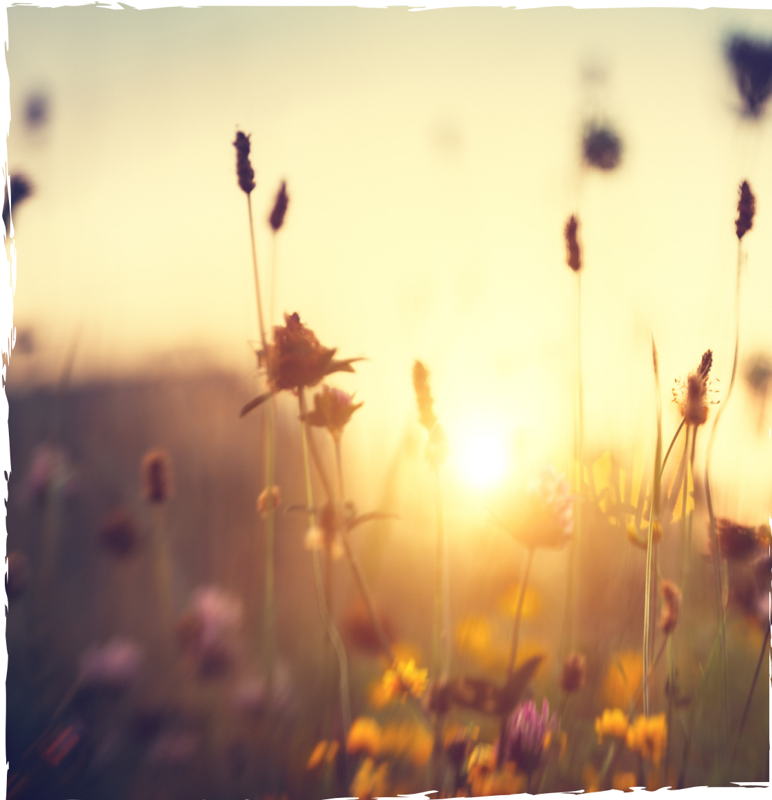
SOLAR: Low-carbon liquid fuels made from solar renewable energy are sustainable liquid fuels with no or very limited net CO 2 emissions during their production and use compared to fossil-based fuels.