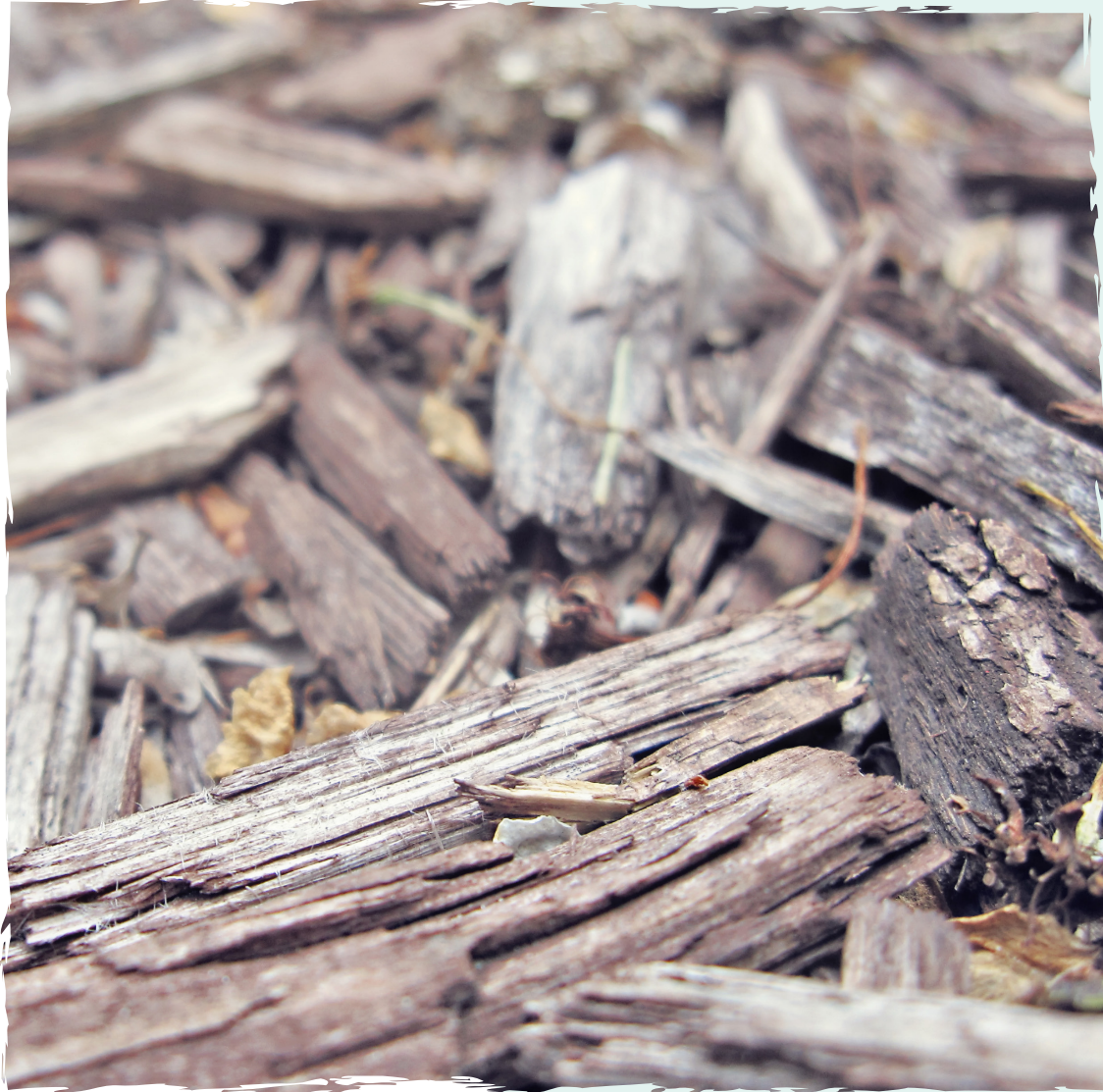
BIOMASS: Low-carbon liquid fuels made from biomass are sustainable liquid fuels with no or very limited net CO 2 emissions during their production and use compared to fossil-based fuels.

The EU refining industry stands ready to step up collaboration with other industries and with EU policymakers, to take bold climate action together. In order to deliver climate neutral transport by 2050, we urge EU policymakers to establish a high-level dialogue in 2020 with all concerned stakeholders to create the necessary policy framework. The following key policy principles are central to delivering our 2050 climate-neutral ambition and should serve as a starting point for discussion: