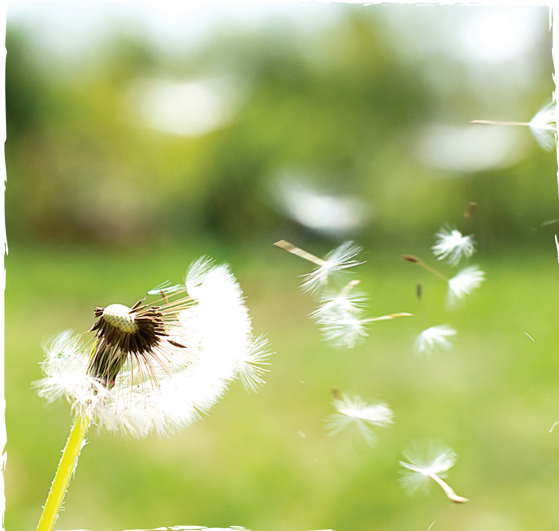
WIND: Low-carbon liquid fuels made from wind renewable energy are sustainable liquid fuels with no or very limited net CO 2 emissions during their production and use compared to fossil-based fuels.

LCLF will smooth the deployment cost of electric energy distribution and fast charging infrastructure in road transport, by providing flexibility and alternative sources of low-carbon energy using mainly existing facilities.