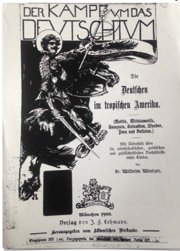
Fig. 3 Book Cover: Wilhelm Wintzer's Der Kampf um das Deutschtum: Die Deutschen im Tropischen Amerika [The Fight for Germanness: Germans in Tropical America]. München: Lebmann, 1900.