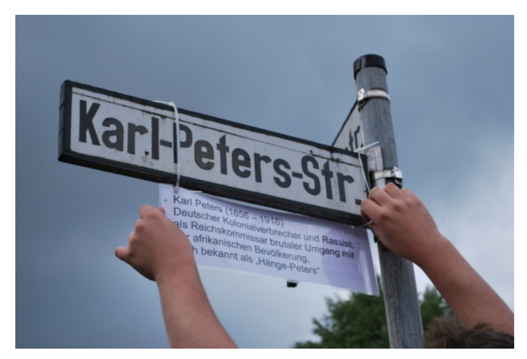
Fig. 9

Young Germans are reengaging with their colonial history, emphasizing a postcolonial turn that aims to critique, and, at the same time, inform the larger public about Germany's colonial past. The project <u>Freedom Roads: Koloniale Straßennames. postkoloniale erinnerungskultur</u> started by the Berlin Postkolonial group aims to take street names, or at times whole neighborhoods, named after German colonial figures and provide them with new context about the legacy of the German Empire. In Munich, "Von Trotha Street" was renamed Hererostrasse to commemorate the agents of the anti-colonial rebellion, rather than the commander of the German Schutztruppe, Lothar von Trotha, who was responsible for their genocide. In 2006, in Bielefeld, a group performed a recreation of the German colonial experience in East Africa at Karl-Peters Straße . Likewise, the project <u>Afrika-Hamburg.de</u> archived more than 5600 votes and compiled more than 800 responses from Hamburg's citizens debating the future of the statue of German East Africa's bloody governor Hermann von Wissmann. Between 200,000-300,000 people have walked by the monument and read the information about its historical context.