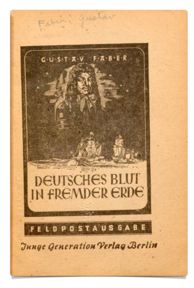
Fig. 6 Book Cover: Gustav Faber's Deutsches Blut in Fremder Erde [German Blood in Foreign Lands] (Berlin: Junge Generation, 1944). Wartime edition.

Philipp von Hutten, as "great" German heroes who battle (and sometimes lose) against both "foreign" agents and native populations.