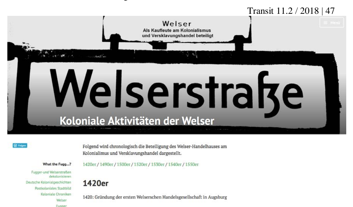
Fig. 8 Screenshot from the website: Fugger-und-Welsersraßen decolonizieren!