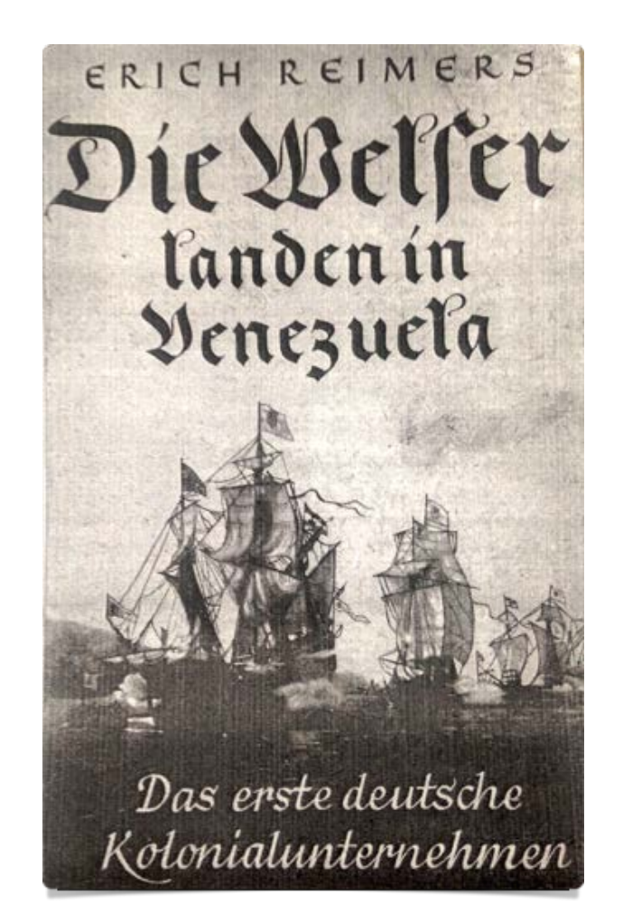
Fig. 4 Book Cover: Erich Reimers' Die Welser landen in Venezuela. Das erste deutsche Kolonialunternehmen. [The Welsers Land in Venezuela: The First German Colonial Undertaking]. Leipzig: W. Goldmann, 1938.

The colonial anxieties manifested in this narrative emphasize the power of the German empire and its leader as being recognized by the Spanish, Flemish, Burgundians, Croatians, Greeks, and Italians. The "brown Arabs" and "black Ethiopians" represent colonial subjects who also recognize the superiority of the Empire.