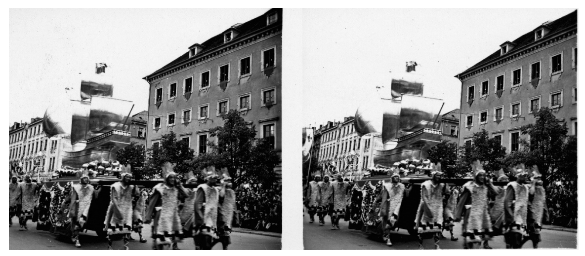
Fig. 5 Tag der Deutschen Kunst 10. Juli 1938 (Day of German Art July 10, 1938-Munich). The group picture depicts the Welser float. Stereograph photograph by Heinrich Hoffmann. (Courtesy of Art Resource/BPK Bildagentur, Bayerische Staatsbibliothek München Abtlg. Karten u. Bilder).

In short, the Nationalist Socialist version of the Welsers in the 1938 Tag der Deutschen Kunst was that they had succeeded where other nations had failed. It was through their capital that they were allowed access to the lucrative overseas market. The Venezuela possession became an icon for wealth in territories and labor. Here the human slaves whom they kept as servants are featured as part of the exotic menagerie that accompanies the Welsers, no different from their pets. In this orientalizing image of the Welsers, they are remembered for living a life of luxury and travel, carried on the backs of humble servants.