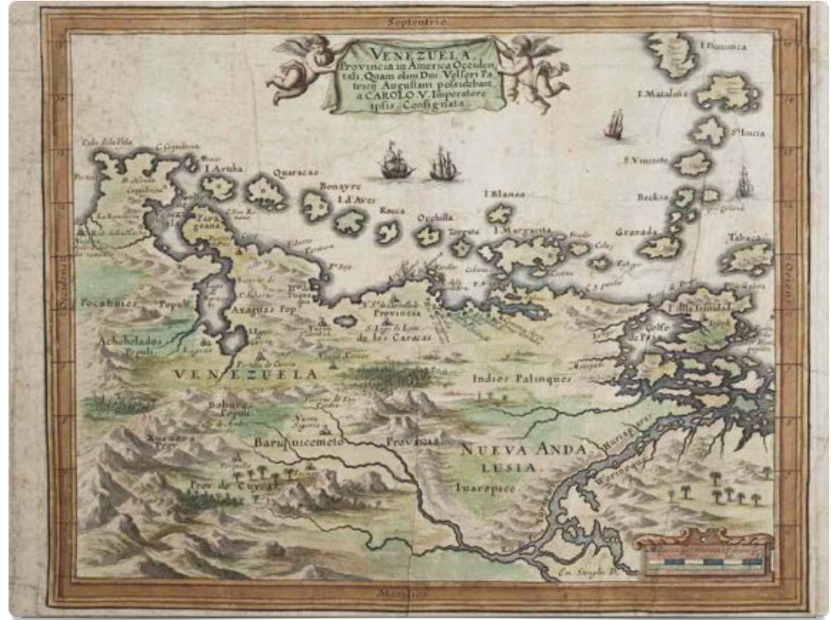
Fig. 2 Details from Genealogical Table of the Family von Welser, 1666, with engravings by Georg Strauch and Emanuel Stenglin.

As White acknowledges in his investigation of the philosophy of history and metahistory, history is not about the fight between "fact" and "fiction." Rather, historians wish for the discourse of history "[to] be faithful to its referent" even though it has "inherited conventions of representation that produced meaning in excess of what it literally asserted" (51). This excess of meaning developed into the florid literary style that became part of nineteenth-century positivist historiographical convention. To analyze this "literary excess" in the context of historical narrative, it is necessary to examine how both narrator, and the era in which the narrative was told, helped determine Welser-Venezuelan history in nineteenth-century Germany.