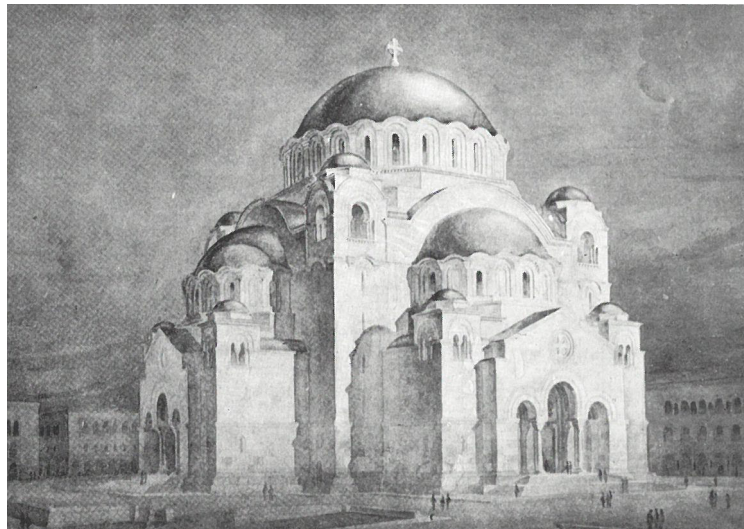
Figure 4. Nestorovic and Deroko, Saint Sava Church, final joint project (Jovanovic, Z. (1991). Aleksandar Deroko . Beograd: RZZZSK, p. 67).