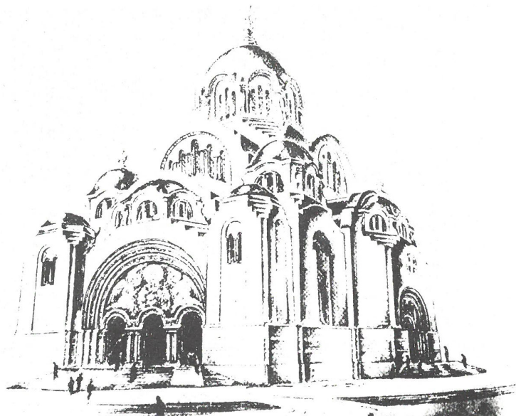
Figure 2. Deroko, Saint Sava Church, a centrally planned edifice in the Serbian-Byzantine tradition, competition drawing (Jovanovic, Z. (1991). Aleksandar Deroko . Beograd: RZZZSK, p. 66).

the final decision to construct the building after unified designs by Bogdan Nestorovic and Aleksandar Deroko. 1 Published in the period's press, the opinions of noted architects and artists are a source for the exploration of various issues; for example, the complex questions of national identity which were an unavoidable consequence of the endeavour to construct a grand Serbian Orthodox structure in the capital of the heterogeneous multinational political society of the Kingdom of Yugoslavia. However, in this paper, the focus is on the formal criticism of the architectural solution for the Saint Sava Church. Responding to the conditions put forward by the 1926 competition, architects Nestorovic and Deroko designed a centrally planned edifice, in the Serbian-Byzantine tradition. Shaped like a Greek cross, the structure is covered with a large central dome, supported by four pendentives and flanked on each side by a system of four smaller domes and lower semi-domes.