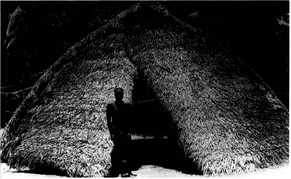
Plate I. An Onge communal hut on Little Andaman Island.

was preferred by the aryoto as they were required to move camps more frequently on account of changing fishing and turtling conditions (Radcliffe-Brown 1922:30–32). Another factor that induced greater mobility along the coast was the smell that arose from rubbish heaps that were allowed to accumulate close to habitation areas (Man 1883:105; Radcliffe-Brown 1922:30). Habitation areas generally consisted of separate shelters facing inwards and arranged in a roughly oval pattern. Camps tended to be moved every two or three months, but over short distances of 1–2 km.