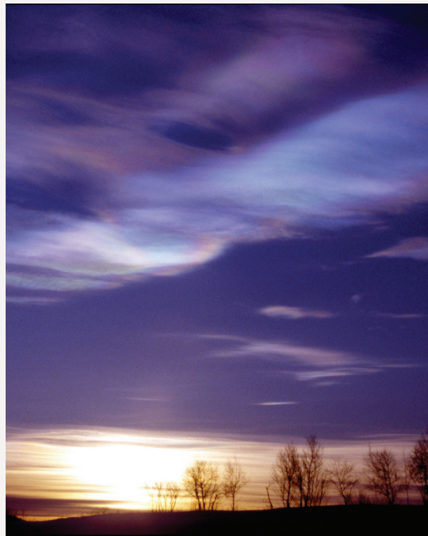
Figure Q10-2. Polar stratospheric clouds. This photograph of an Arctic polar stratospheric cloud (PSC) was taken from the ground at Kiruna, Sweden ( 67^{\circ}\text{N} ), on 27 January 2000. PSCs form in the ozone layer during winters in the Arctic and Antarctic stratospheres wherever low temperatures occur (see Figure Q10-1). The particles grow from the condensation of water and nitric acid ( \text{HNO}_3 ). The clouds often can be seen with the human eye when the Sun is near the horizon. Reactions on PSCs cause the highly reactive chlorine gas ClO to be formed, which is very effective in the chemical destruction of ozone (see Q9).