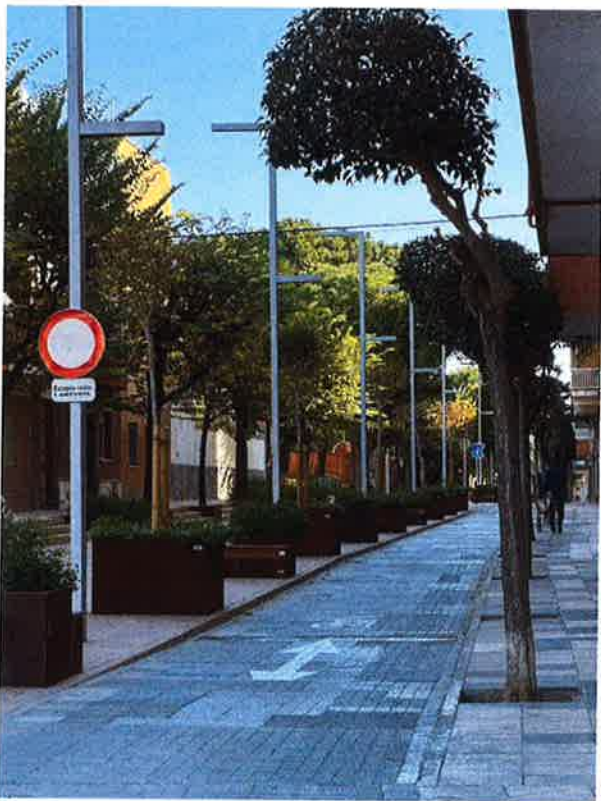
Figure 4: Carrer de les Torres

Another division they pointed out was in the very center of the city, and it is represented – in this couple narrative – by the two streets just below the railroad, full of beautiful houses.