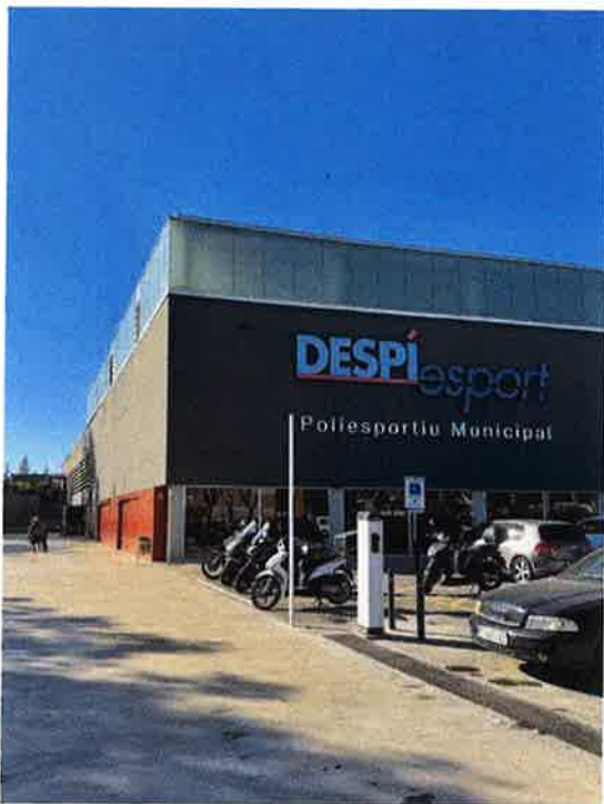
Figure 6: Poliesportiu Municipal

We think this guy lives Sant Joan Despí almost fully , knowing history of the town, being interested in its economic development, and moving from one neighborhood to another, mostly to see friends.