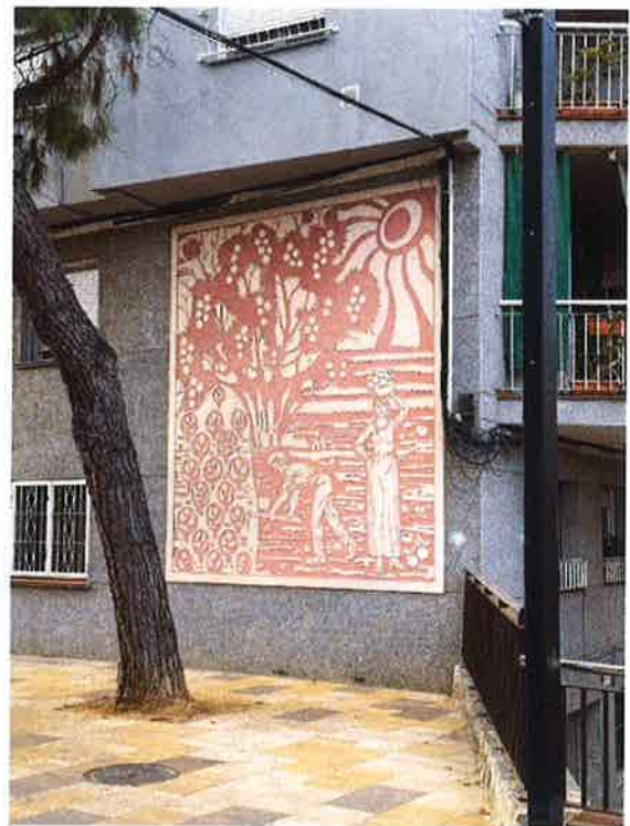
Figure 2: A picture in Passeig del Canal

Described as beautiful building everyone in SJD should know and visit . The king comes here to visit too, occasionally.