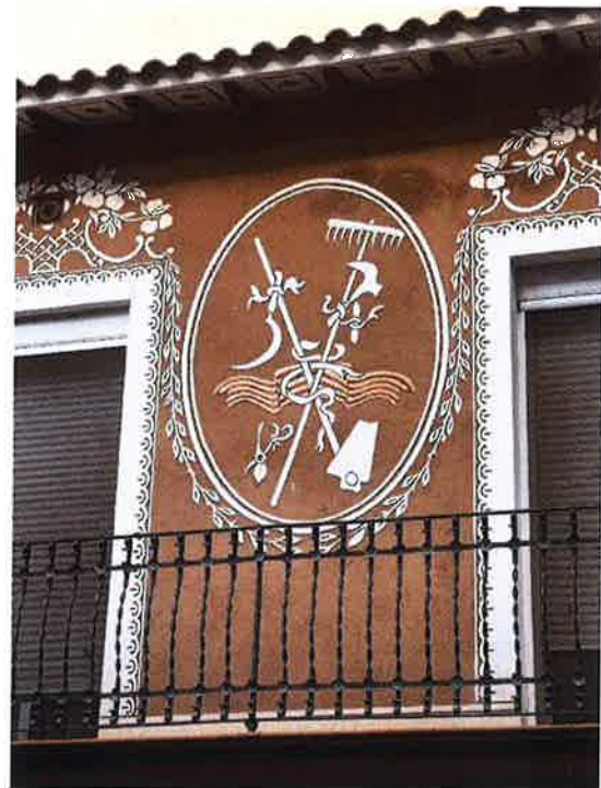
Figure 5: Façade of a store in Carrer de Baltasar D'Espanya

Places we associate with our physical and mental health will always be important for us. This was somehow very tangible in our guy's wording.