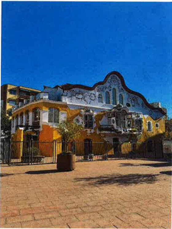
Figure 1: Can Negre-Centre Jujol

They briefly commented the economical dynamics and history of Les Planes , making a comparison between the Centre and Les Planes . The prior is probably richer but apparently it is not as productive and full of life and developing ideas as the latter: Les Planes – these two ladies said – has build through the years a strong sense of community, where people constantly help each other and create businesses with a circular dynamic, meanwhile people of the city center always go to Barcelona to buy everything that is not food (e.g., ropas) .