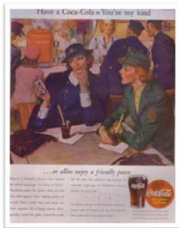
Figure 3.4: You’re my kind, 1944

This ad is an exception to the global high-sign series in that the “allies” who “enjoy a friendly pause” in the image are a Navy WAVE and the Marine with whom she is sitting. The women share in the experience of drinking Coca-Cola and military