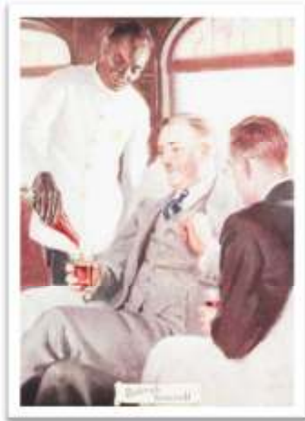
Figure 4-1: Refresh Yourself, 1924

the center of both images, and central to the company's marketing campaign were white consumers and, of course, the bottles of Coca-Cola.