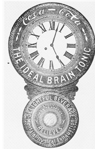
Figure 1--3: Promotional Serving Tray and Wall Clock

tray, Coca-Cola's promotional items were used by people entertaining guests in their homes. In this way, the Company recognized white middle and upper-class women as consumers and the primary shoppers for their families – converting women to loyal customers would mean winning over families. 26 The costs of these items were little, compared with the value gained in brand recognition.