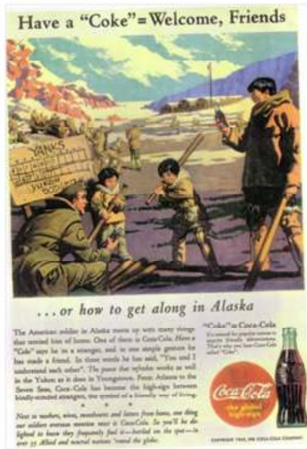
Figure 3.2: Alaska, 1943

In the collective American imagination during WWII, foreigners posed a threat at home and abroad. Yet, Coca-Cola ads during these years carried a tone of warmth and benevolence. The Coca-Cola Company acted out of a belief that it was doing other countries a favor by bringing them Coke. The bubbly drink was marketed as a method of