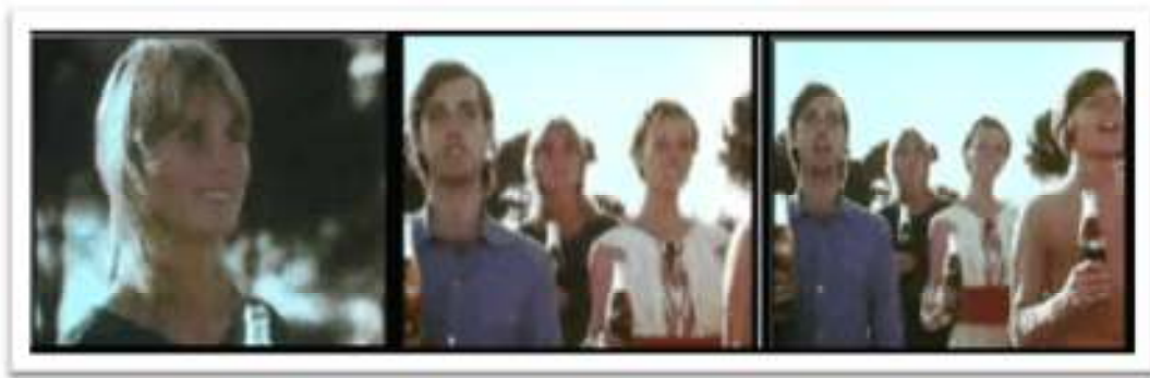
Figure 5-3: Hilltop Commercial - Still Frame Image No. 1, 1971

number of mishaps that required filming the commercial in two locations and with three different groups of actors. The location was moved from the rainy cliffs of Dover along England's southern coast, to the more temperate climate of Rome, Italy. A youth choir in England had originally been chosen to star as extras in the commercial, but as time and money were running out, the size of the chorus in the commercial was scaled back. To replace the ranks of the real student chorus of 12,000 selected in England for the original plan, the team searched for 500 replacements, first at schools and hostels, and finally by