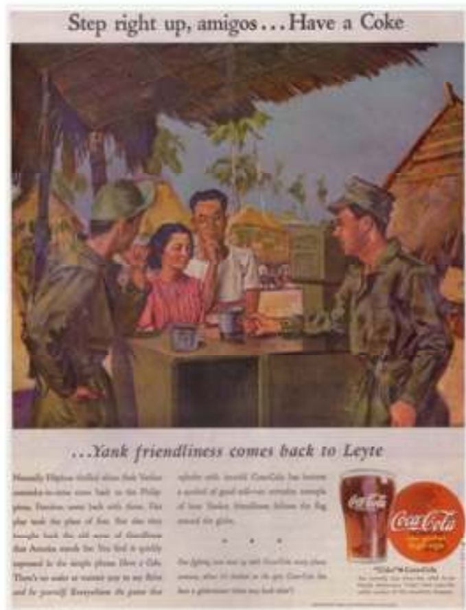
Figure 3.3: Leyte, Philippines, 1945

the imperial and corporate mission of expansion.