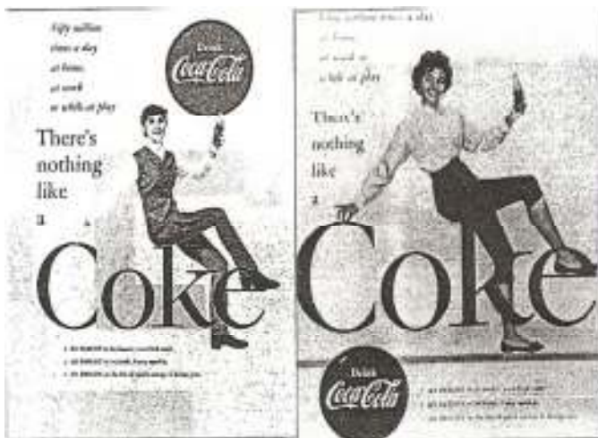
Figure 4-0-3: There's Nothing Like a Coke

In one classic example, from 1955, two almost identical ads were published. In one the model is white. The word “Coke” is written across the page and she sits atop of the “K” and leans back to rest her right hand on the “C.” In her left hand she holds up a bottle of Coca-Cola. The slogan for this ad was “Fifty million times a day at home, at work or while at play There’s Nothing like a Coke.” Simultaneously, an ad with the same logo ran in Ebony magazine, except in that ad, the model was African American. She is posed in the same way, seated atop of the word Coke and beside the same slogan.