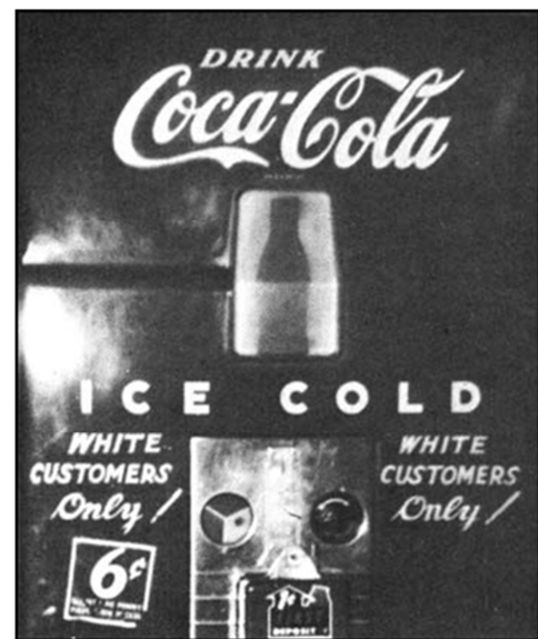
Figure 4-0-2: White Customers Only!

that were either labeled "white customers only!" or had two separate sides labeled "colored" and "white." Word spread fast after The Southern Patriot , official publication of the Southern Conference Education Fund, Inc. (SCEF) ran the story. It was picked up by the NAACP and photos were published in The Crisis over the summer. This news story, of what was being heralded by Walter White, the