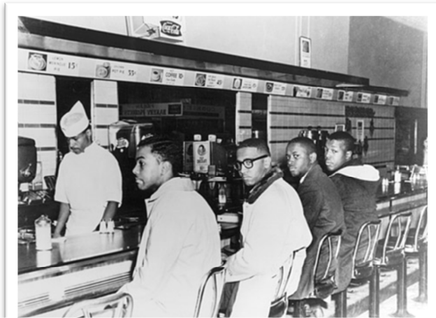
Figure 5-2: Greensboro Four, 1960

Protests continued to connect Coca-Cola to the problems of Jim Crow. On February 1, 1960, an African American student-led protest grabbed the attention of the domestic and international press. Four students from North Carolina Agricultural and Technical College, a historically black college, sat in at a segregated Woolworth's lunch counter in the city of Greensboro. Seats were reserved for white customers only. The students expected to be refused service at the lunch counter, they were usually forced to stand and eat. As planned, on that day, these four students sat and stayed at the lunch counter after being refused service. The students staged a sit-in that lasted five days, and