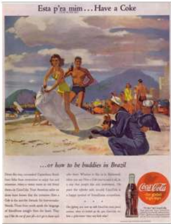
Figure 3.5: Brazil, 1944

created to counter American attitudes; on the contrary, when it came to gender norms, they reinforced them.