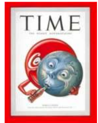
Figure 5-1: World as Friend

Coca-Cola was not alone in its confidence that international sales were significant and growing. The American press celebrated its success. On May 15, 1950, Coca-Cola became the first commercial product featured on the cover of Time magazine. Woodruff declined having his picture on the cover. In his place was a smiling cartoon-type illustration of the Company's red logo holding up a Coke to the lips of a personified Earth. Beneath the image were the words, "World & Friend. Love that piaster, that lira, that tickey, and that American Way of Life." 13 This strange image depicted Coca-Cola as larger than the Earth, a child-like being with no arms being cradled and bottle-fed by the Company. Inside the magazine the featured article was titled, "The Sun Never Sets On Cacoola," which celebrated the Company's global presence and international reach – an American capitalist influence that never slept. The article was a glowing review of the Company as a successful model for American corporate global expansion. It made the case that Coca-Cola was the "sublimated essence of all America stands for" and that its success was "also simpler, sharper evidence than the Marshall Plan or a Voice of America broadcast that the U.S. has gone out into the world to stay." The article, and the cover, expressed a kind of mainstream belief that Coca-Cola was leading the way in American corporate globalization.