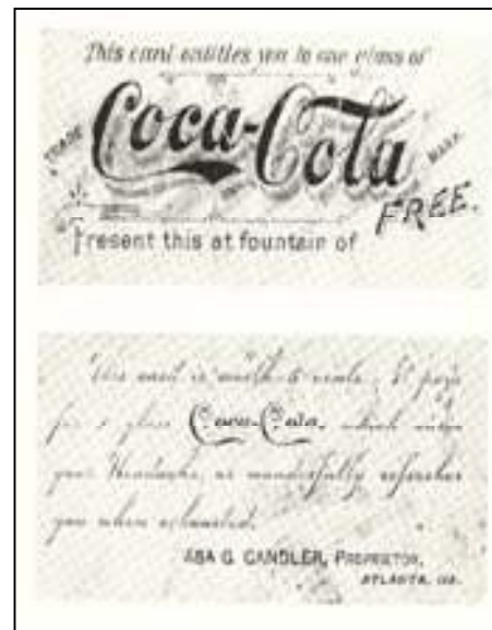
Figure 1-2: Drink Ticket

Printed on the back of cards like this one, was written: “This card is worth 5 cents. It pays for 1 glass of Coca-Cola, which cures your Headache, or wonderfully refreshes you when exhausted.” The store’s owner could redeem the tickets for their full value from the Company to make a guaranteed profit. Moreover, free samples helped to create loyal