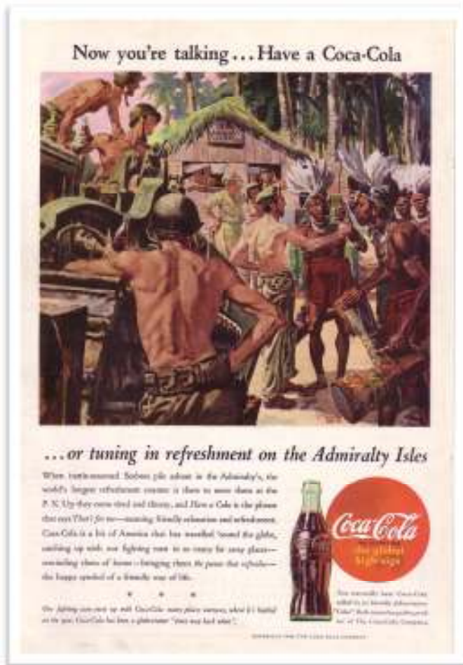
Figure 3.7: Admiralty Isles, 1945

not only a different race but also a primitive culture. They are represented as primitive people and a pre-modern society. Additionally, they are the only group where no apparent sameness is made visible, and they are the only ones not drinking or being