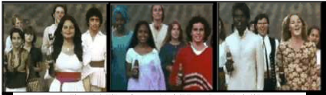
Figure 5-4: Hilltop Commercial - Still Frame Image No. 2, 1971

The commercial starts with her alone and then the camera works its way down the first two lines of the crowd that was arranged into the shape of a triangle on the hill. Cameras were positioned on the ground and in a helicopter to get aerial shots. The principal actors, lip-synching, were dressed to reflect different nationalities. Clearly visible in the commercial is a Latino man, an Indian woman, two African men and one African woman, one Japanese woman, and one white man in a suit. Everyone holds bottles of Coke. If one fiction embedded in the ad is that the shared consumption of a soft-drink alone could bring about peace, a second was about the reality and significance of difference represented in the commercial. The actors were not necessarily