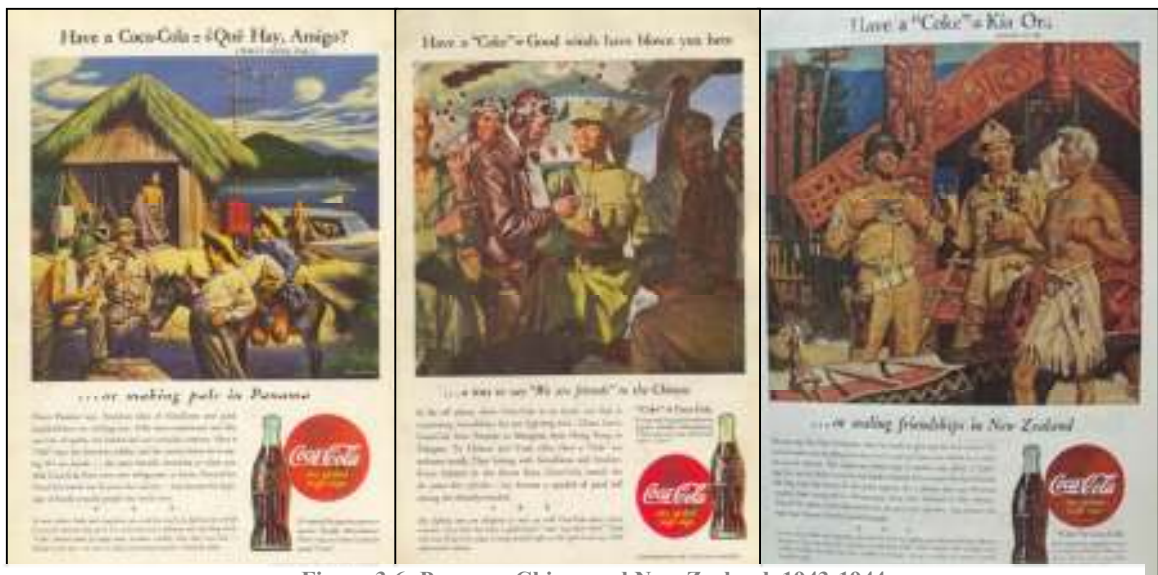
Figure 3.6: Panama, China, and New Zealand, 1943-1944