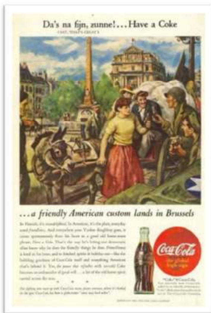
Fig 3-1: Brussels, 1945

The global high-sign campaign was a patriotic wartime series, similar to previous and concurrently running ads, but this one coincided with the U.S. entry into WWII and Woodruff's pledge to supply American troops with bottles of Coca-Cola for a nickel. Moreover, this particular patriotic series utilized an earlier theme of friendship and sharing at the soda fountain that was at the core of Coca-Cola's strategy for national and international expansion. This mid-century variation paid homage to the heroic men and women who served in the U.S. military. The corporate and interpersonal gesture of