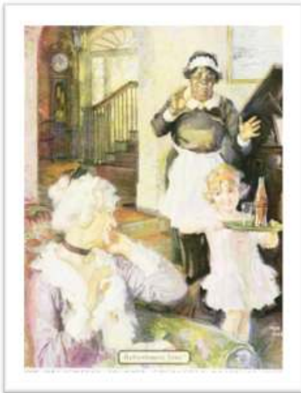
Figure 4-1: Refresh Yourself, 1925

In the relatively few instances when African Americans were featured in Coca-Cola's advertisements during the first half of the twentieth century, they were represented as workers in subservient roles; as maids, butlers, or drivers. Leisure and relaxation were key for a company that had long used the slogans "Refresh Yourself" and "The Pause that Refreshes." 11 The Coca-Cola brand did not simply reflect American tastes and values; it helped to produce the image of an idealized white America. This ad, published