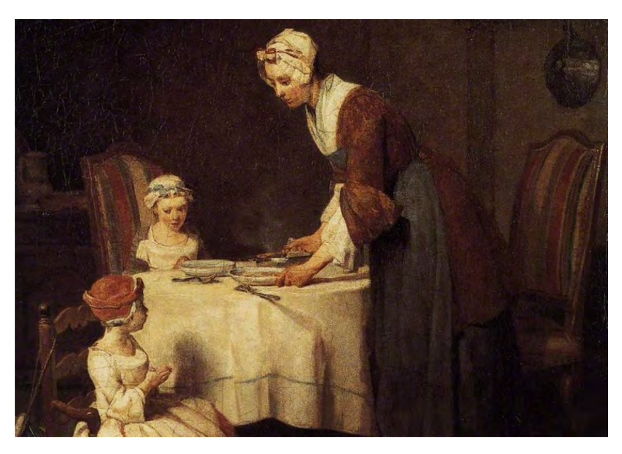
A detail from Grace at Table by Jean-Baptiste-Simeon Chardin (1740)