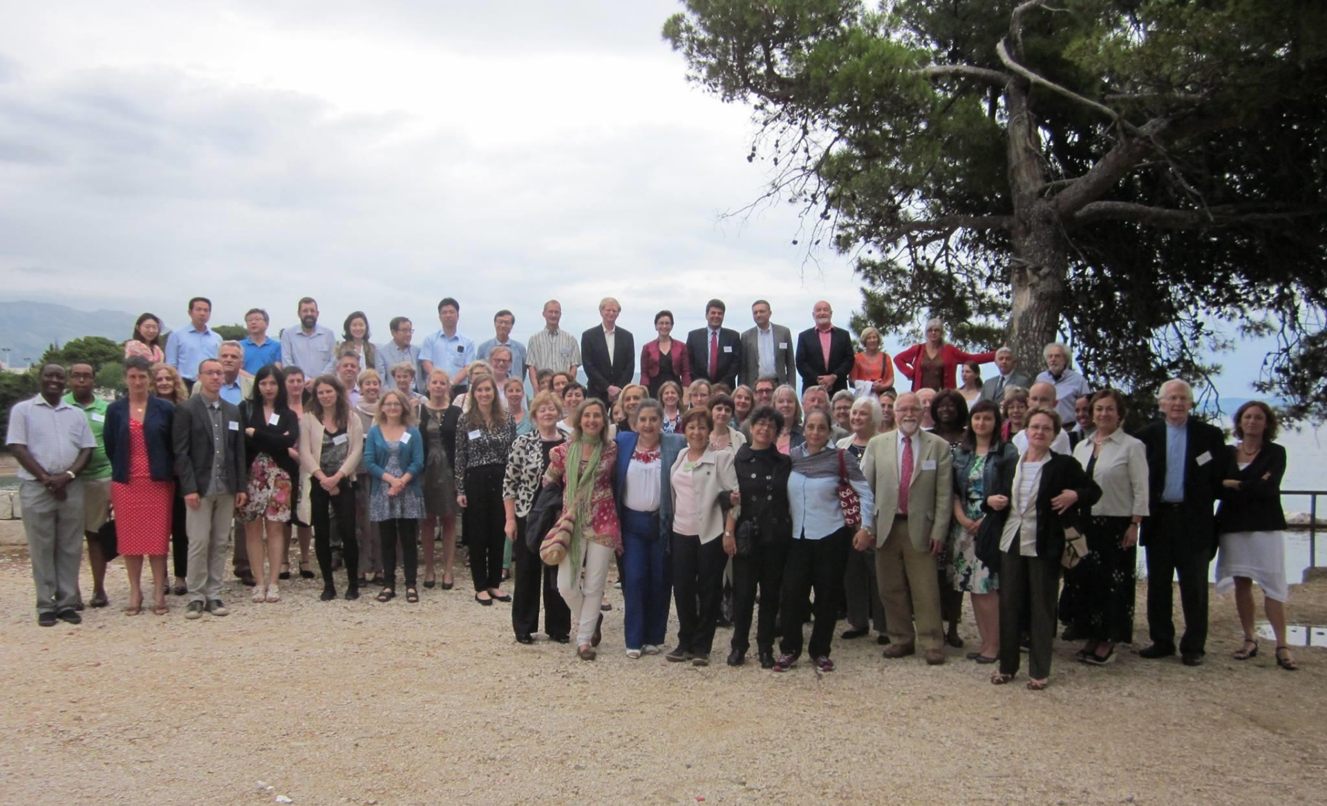
EASE Conference in Split, Croatia, June 2014