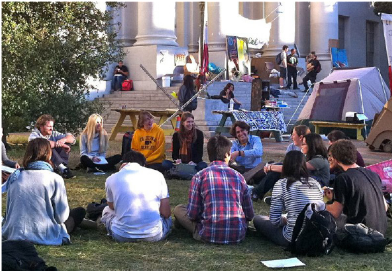
Student teach-out in front of Sproul Hall during campus general strike. Photo by Andrea Broaddus, Nov. 9, 2011.

public spaces. Throughout the fall of 2011, from Zuccotti Park to the wide sidewalks of Market Street in San Francisco to Oakland's Frank Ogawa Plaza and beyond, the 99% sprang up in a repeated ritual of reclamation—of space, of community, and of political discourse. Spaces that had been accepted unquestioningly as monolithic civic manifestations of “the public at large” were suddenly occupied by an insurgent civitas. Central squares and public parks, all policed and passive places, were recast overnight as the symbolic loci of struggle against 21st century capital's destabilizing redistribution of wealth and civic access.