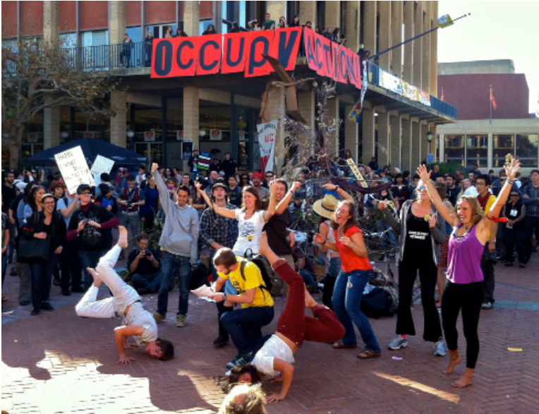
On November 15, students and faculty used art and dance at the “Open University” to express support for the Occupy Cal movement.

social value. In so doing, Occupy Cal translated years of resistance to rising tuition, decaying state support for higher education, and growing administrative salaries into a palpable image of the University as a space by, of, and for the people of California. In this space, local struggles were at once connected to a rising global consciousness of injustice, and brought back to the campus grounds where they are lived each day.