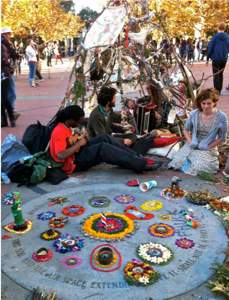
A stick tent constructed during the November 15 general strike to symbolize the fragility of the protesters.

At Wurster Hall, home to the College of Environmental Design, students of landscape architecture, city planning, and architecture embraced public space to speak this insurgent language, but infused it with particular levity. They could have remained holed up in the studio as the din of helicopters and sirens buzzed around, but instead, planners and landscape architects responded. While police wielded batons against their colleagues' bodies, Environmental Design students directed a message at their spirits, in the form of tents filled with helium balloons. It was an iconic way to summarize the new language of occupation and visibly demonstrate contested notions of public space: tents floating over the very site from which protesters had