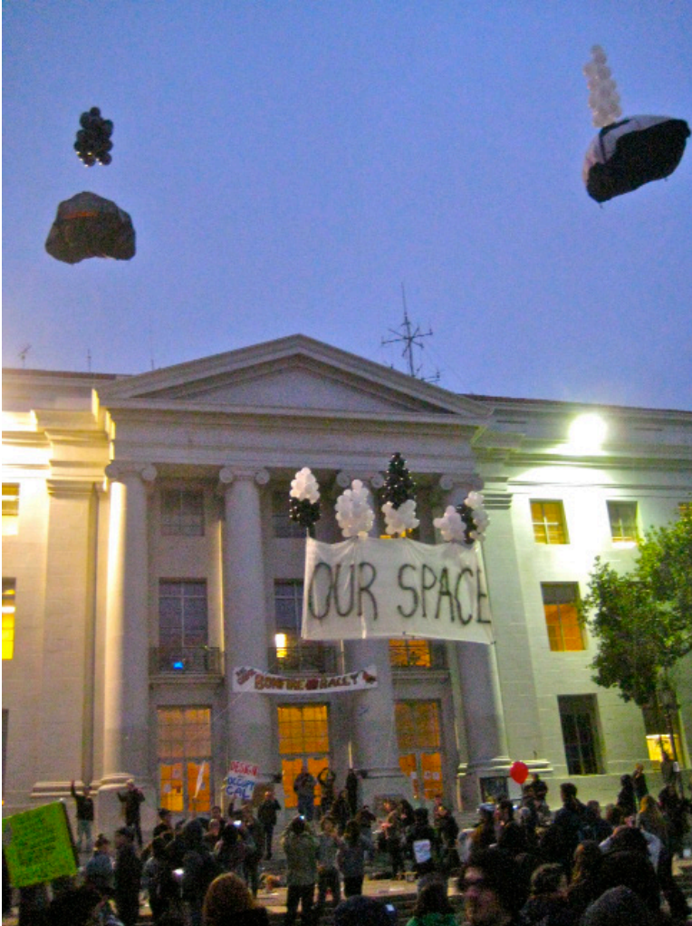
City planning students bring floating tents and “Our Space” banner to Sproul Plaza. Photo by Jessica Kuo, November 15, 2011.

been forcibly removed. This design intervention qua protest tactic begged the question: where exactly does the intersection between competing lexicons of order and dissent begin and end — an inch off the ground, ten feet? The answer was clear: in our minds, where there is no end in sight.