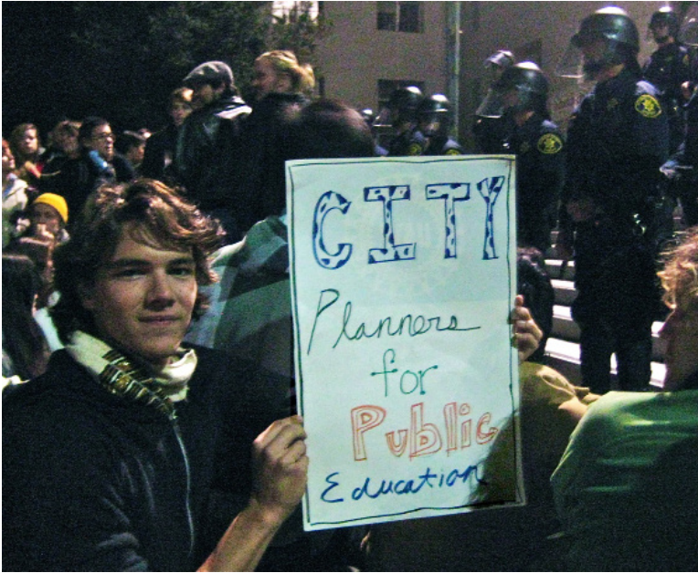
The author on November 9, before being beaten by police batons.

Documented moment by moment by the UC Berkeley student newspaper, the Daily Californian , the police beat student and faculty protesters with batons, breaking ribs; ultimately they tore down the tents and made thirty-nine arrests (The Daily Californian 2011).