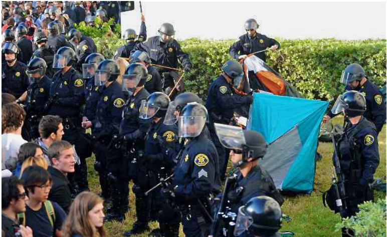
Student protesters used tents, a symbol of the Occupy Movement, to politicize and transform the space into Occupy Cal.

On November 9, a crowd of over 1,000 adopted the newly minted lexicon of occupation, set up tents on Sproul Plaza, and declared Occupy Cal underway. Suddenly, the university found itself in the company of financial hubs, civic centers, and parks and plazas the world over, when it too was re-appropriated by the sleeping bags and “mic checks” of the 99%. The Chancellor’s reaction was swift and brutal—riot police were called in from Oakland and Alameda County to break up the Sproul encampment, and they attacked students and faculty in several incidents throughout the day.