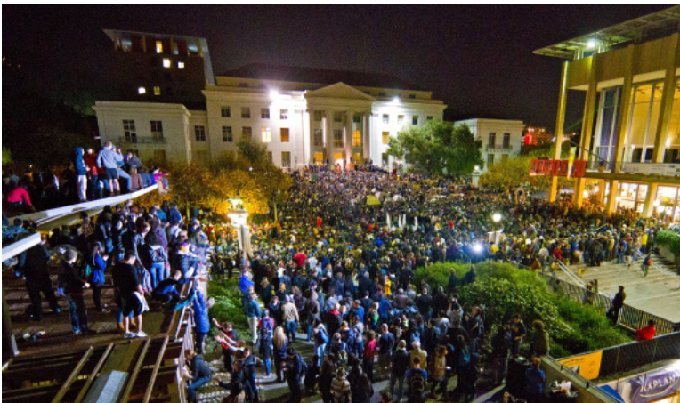
Massive crowd attending the Robert Reich speech in Sproul Plaza, November 15.