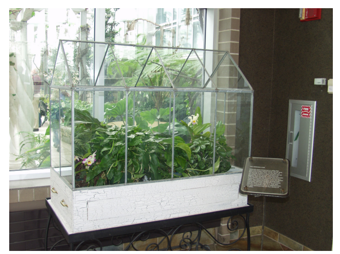
Figure 1. A Wardian case for transporting and maintaining plants.

A terrarium, a garden in an enclosed glass or plastic container, is a delightful way to grow a collection of small plants. With proper care, a terrarium will create a humid atmosphere that protects tender, tropical plants that are difficult