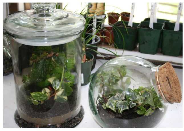
Figure 2. Larger plants can be used as a focal point in the center of a terrarium to be viewed from all sides.

Gently remove the plants from their pots, avoiding damage to their root systems. Plant the taller, vertical plants first to