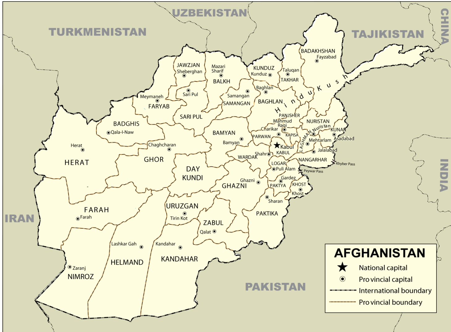
Figure I. Map of Afghanistan